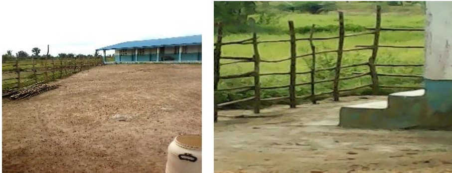
Little Wlebo Extension Elementary School fencing