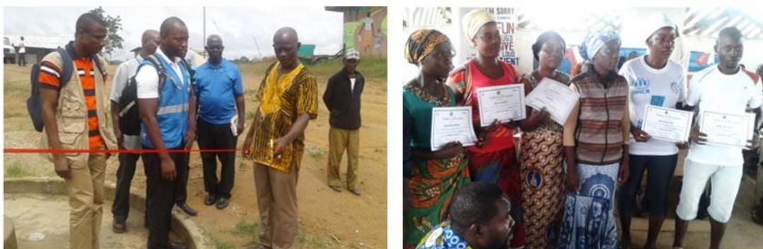
WASH handover ceremony and technicians with their certificates.