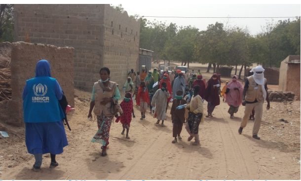
Relocation of Nigerian Refugees to Chadakori site

campaigns on a wide range of topics including COVID-19 and malaria prevention, child protection and sexual and gender-based violence (SGBV), reaching 15,291 persons of concern and members of host communities.