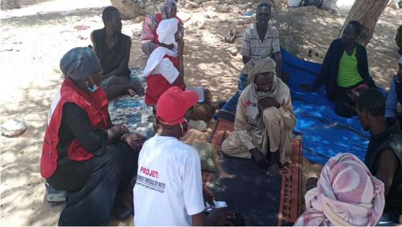
Discussions between a CRT agent and evictees at the Ounianga site in July