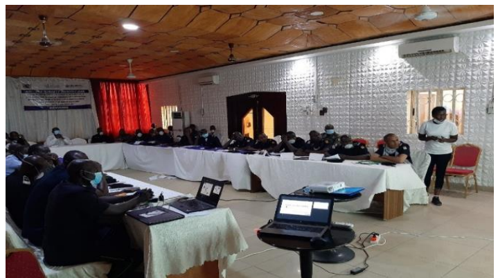
UNHCR and IOM working session