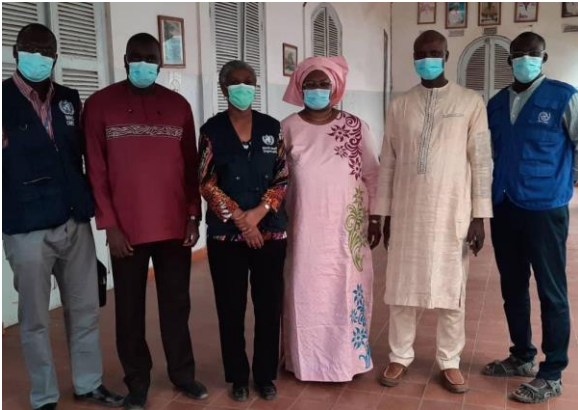
Joint assessment mission to the St. Louis Entry Points: UNHCR, IOM and WHO Representatives