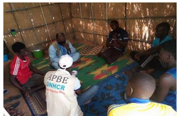
A medical team holding an awareness session on hygiene and COVID-19

The strengthening of border monitoring and communication mechanisms between the UNHCR offices in Mali, Mauritania, Burkina and Niger was discussed during the three cross-