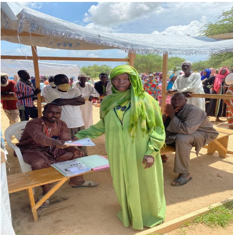
Distribution of ID cards & proof of registration to refugees in Kouchaguine-Moura camp

Following the registration exercise completed on 8 August, the issuance of refugee ID cards and proof of registration started in Kouchaguine-Moura camp on 19 August for the population registered in UNHCR's proGres database.