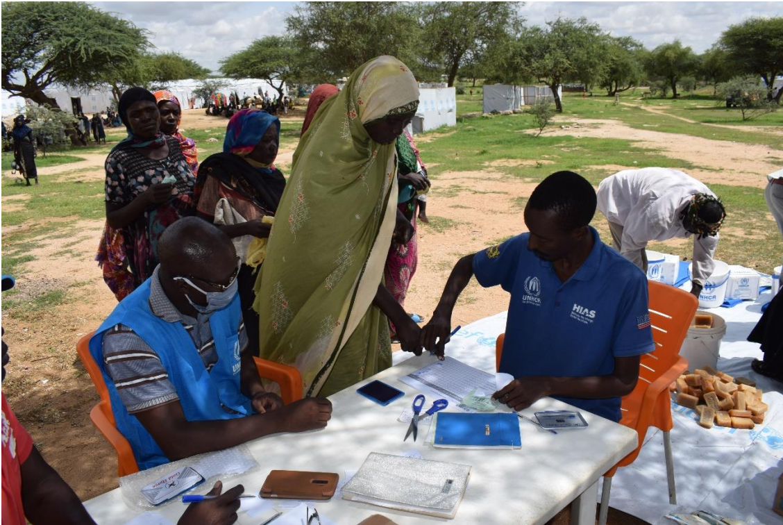
Distribution of core relief items to the refugees newly arrived in Kouchaguine-Moura camp