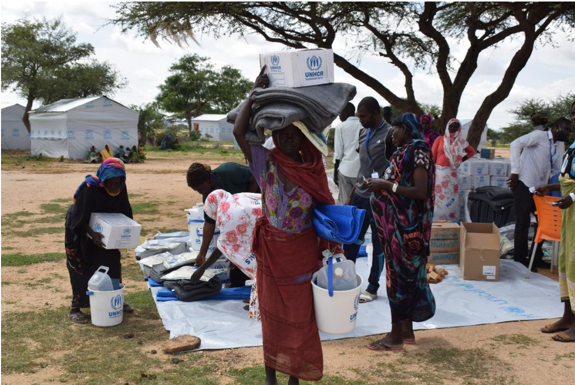
New arrivals receiving core relief items upon arrival in Kouchaguine-Moura camp