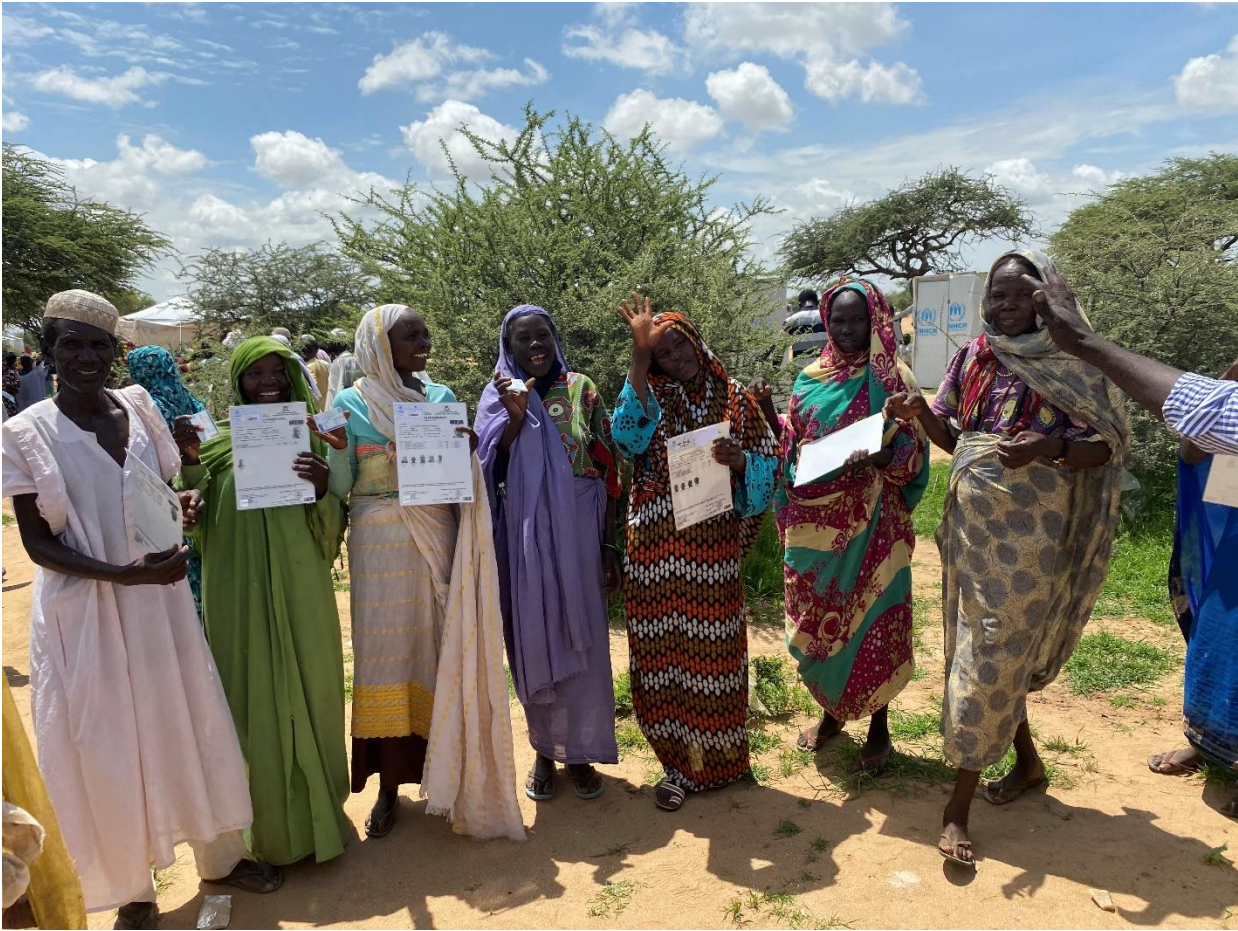
Refugees in Kouchaguine-Moura camp very happy after receiving their documents