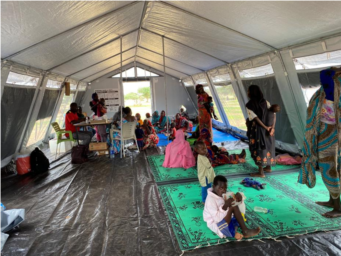
Health facility (consultation room) in Kouchaguine-Moura camp

Following the most recent new influx from Sudan, a mobile clinic was put in place to provide primary health care to asylum seekers arriving from Darfur in the Chadian villages along the border, namely in Mamata, Katarfa, Goungour and Gofota villages.