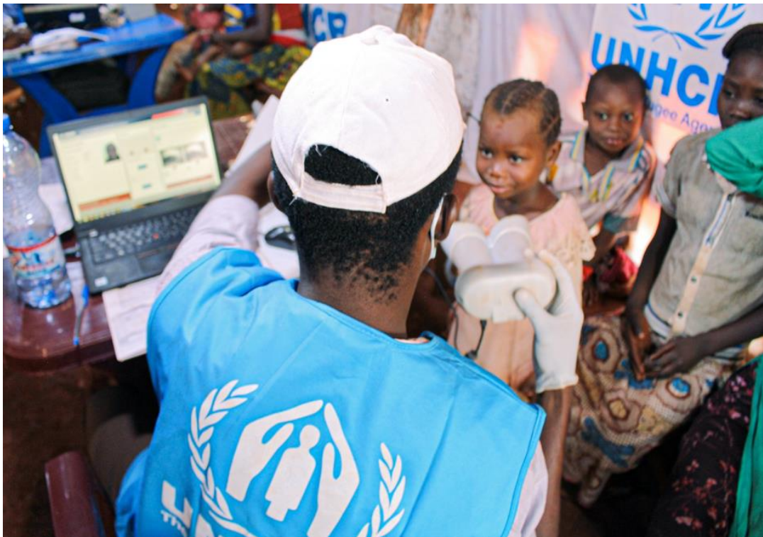
A family of Central African refugees are biometrically registered by UNHCR staff in the village of Ndu, Bas Uele Province, Democratic Republic of the Congo.