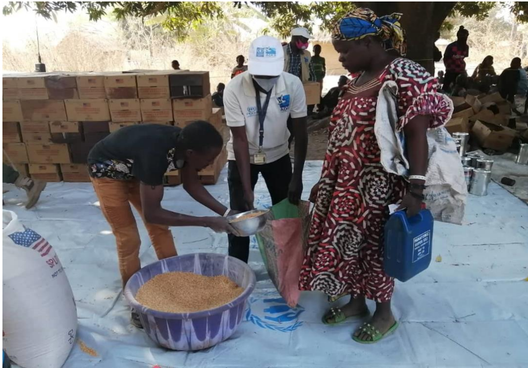
Food distribution organized by WFP for newly arrived refugees in the border village of Ndouba-soh, in Southern Chad.