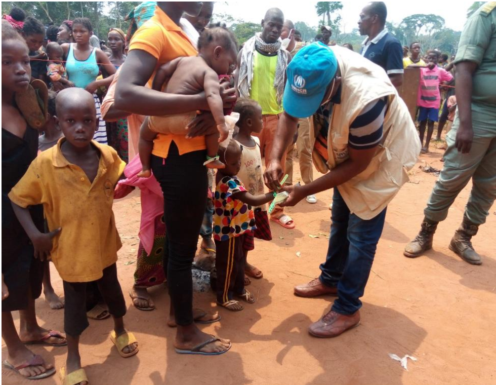
UNHCR staff provide bracelets for emergency registration to newly arriving Central African refugees in Ndongo-missa, Republic of the Congo.