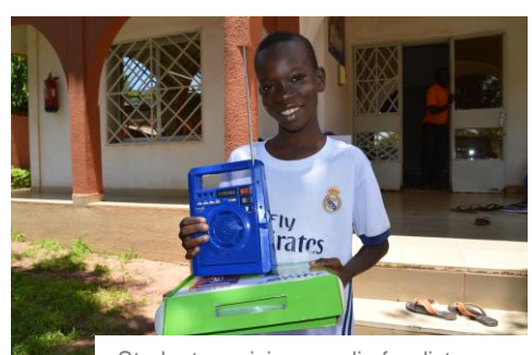
Student receiving a radio for distance learning, after completing primary education.

In Burkina Faso, 83 refugee students took part in the exam session for primary and secondary schools. Following the exams, which began on 14 July after being postponed for a month due to COVID-19, 342 radios were distributed to support distance learning by enabling children to access the Ministry of Education's national programme broadcast. In total, 4,000 portable solar radios were distributed to refugee and host community students. The radios and school kits that accompany them allow students to continue learning and to prepare for the upcoming school year.