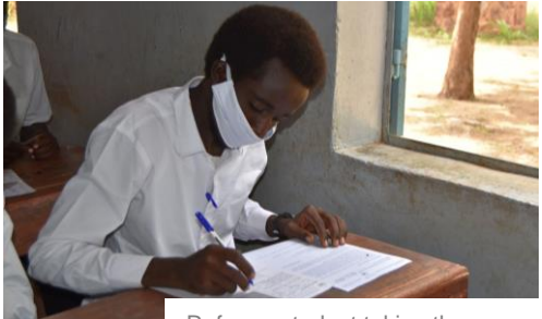
Refugee student taking the Baccalaureate exam in Farchana refugee camp.

In Chad, following the closure of all schools in the country since 19 March due to COVID-19, students who were preparing to take exams during the summer of 2020 returned to class on 25 June. Out of the 1,744 refugee students enrolled in the final year of lower secondary, 1,353 returned to classes, a loss of 22%. For the last year of upper secondary, 1,069 Baccalaureate candidates returned to class out of the 1,420 who were registered in March, a loss of 25%.