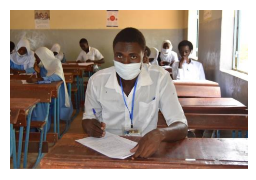
Read UNHCR Chad Flash Infos here.

While all students should return to class in September, the statistics are already showing the negative effects of COVID-19 on the schooling of refugee children.