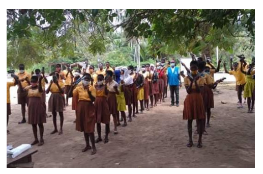
Students receiving school kits in Ampain refugee camp.

Ahead of the Basic Education Certificate Examination (BECE) in September, UNHCR has distributed school kits to refugee children and host community students who are in final year in Ampain and Krisan camps to help them preparing for their exams.