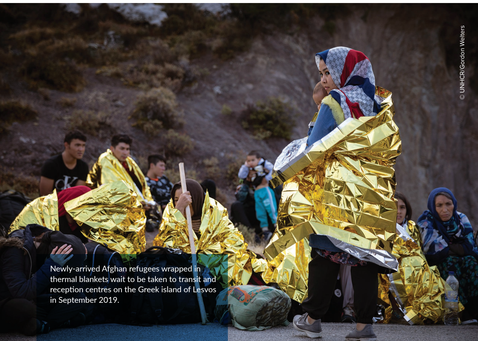
Newly-arrived Afghan refugees wrapped in thermal blankets wait to be taken to transit and reception centres on the Greek island of Lesbos in September 2019.

Arrivals at the Greece-Turkey land border have dropped by 30% compared to last year. Reasons for the decrease appear to be increased preventative