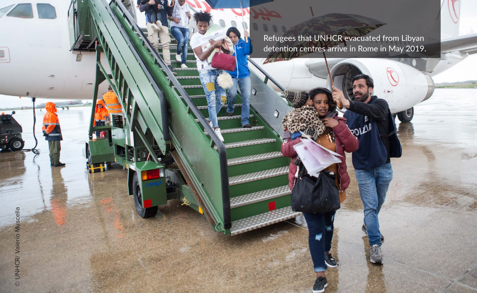
Refugees that UNHCR evacuated from Libyan detention centres arrive in Rome in May 2019.