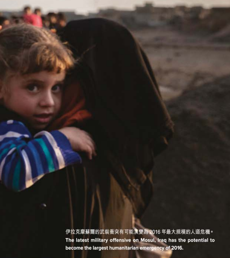
伊拉克摩蘇爾的武裝衝突有可能演變為 2016 年最大規模的人道危機。 The latest military offensive on Mosul, Iraq has the potential to become the largest humanitarian emergency of 2016.