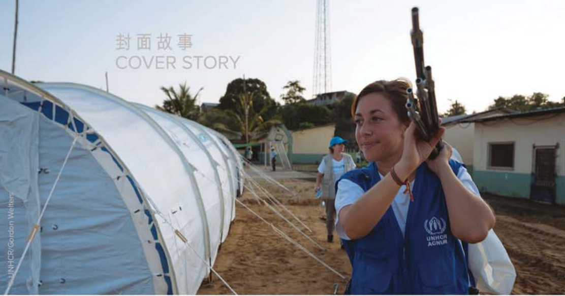
聯合國難民署在厄瓜多爾地震後到達當地展開救援工作。救援人員在查曼加設立由聯合國難民署捐贈的帳篷，以供失去家園的災民暫住。UNHCR on the ground after the earthquake in Ecuador. Our staff installs UNHCR-supplied tents in Chamanga for people who lost their houses.