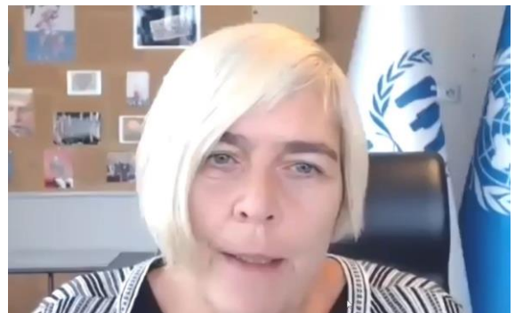
General Director of Migration Management and UNHCR Representative provide opening remarks at the seventh regional meeting with academics held virtually on 4 November