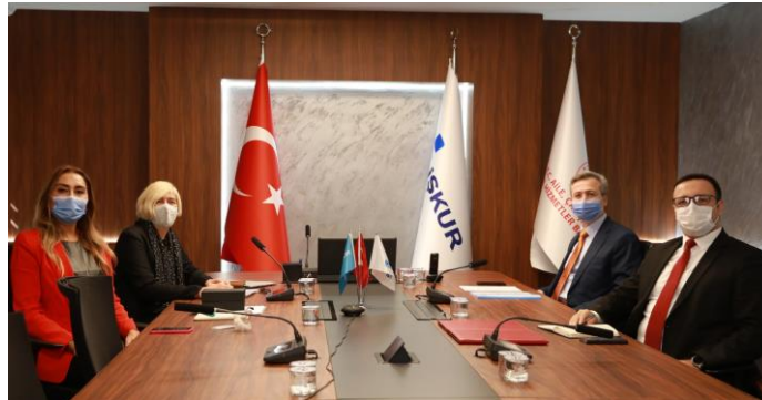
The Turkish Employment Agency (İŞKUR) and UNHCR sign a Letter of Understanding which provides a framework for cooperation.

On 12 November, the Turkish Employment Agency (İŞKUR) and UNHCR signed a Letter of Understanding which provides a framework for cooperation and collaboration between the two institutions. The Director General of İŞKUR and UNHCR agreed to continue the cooperation, in particular related to online platforms as well as the digitalisation of İŞKUR services.