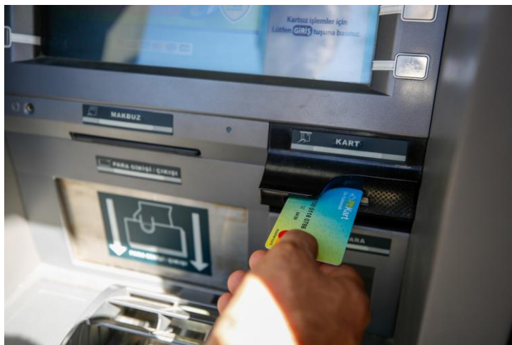
Beneficiaries receive the cash assistance through PTT transfers.

UNHCR will be conducting Post-Distribution Monitoring in July.