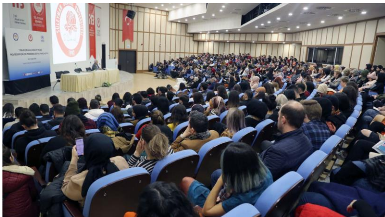
Social cohesion workshop for refugees in Isparta

In Isparta, UNHCR organized a social cohesion workshop for refugees on 20-21 February in cooperation with the Isparta Social Service Association and Suleyman Demirel University. Over 400 students attended the workshop along with academics, local and civil society actors from across the country including Izmir, Istanbul and Ankara. Discussions focused on forced displacement,