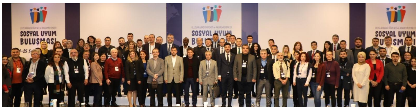
Social Cohesion workshop with academics and international students in Mersin (24-25 February 2020)

Two regional Social Cohesion Workshops with Academics and International Students took place in February. The first was in Samsun from 11 to 12 February with 59 academics from the Black Sea Region and 217 international students. The second in Mersin from 24 to 25 February 2020 with 113 academics from the Mediterranean Region and 224 international students. In the opening remarks of the first workshop, the Deputy Governor of Samsun indicated that migrants in Samsun, as in Turkey, have access to protection, health, education and employment and that it is a duty of public institutions to uphold the rights of migrants in Turkey as laid out by national and international legislation. The Deputy Head of DGMM's Harmonization and Communications Department noted that as of 2019, Turkey had been increasingly focusing on social cohesion efforts. During the event in Mersin, the Governor of Mersin emphasized the humanitarian perspective with which Turkey was managing migration, while the Deputy Director General of DGMM indicated that Turkey had evolved from a transit country to a country of destination within the context of migration. The events were covered on government websites and in the news.