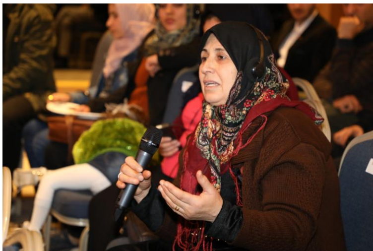
Refuge woman actively participates in Engaged Conversation in Diyarbakir in February

As part of the cooperation with DGMM on harmonization, an Engaged Conversations event was held in Diyarbakir on 19-20 February. The event included focus group discussions on social cohesion with refugees, host community members and service providers as well as a public event. Over 460 people were reached. In addition to the opening remarks of the Deputy Governor of Diyarbakir and the Head of DGMM's Harmonization and Communications Department which emphasised the importance of coordination and communication, DGMM's Head of Department for International Protection and the Head of Diyarbakir's PDMM both noted that strengthening social cohesion between refugees and the host community needed to involve stakeholders other than the state, including civil society, municipalities and universities. The event which took place with the participation of all groups of society, primarily of local and refugee community leaders, featured conversations on local efforts in social cohesion and challenges, as well as recommendations which would further social cohesion initiatives in Diyarbakir.