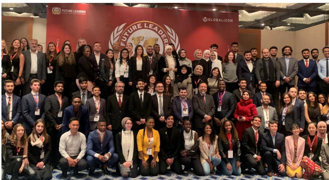
Model United Nations Refugee Challenge with Future Leaders MUN

In February, UNHCR Turkey's Facebook page reached over 37,200 followers and the Twitter account 10,200 followers. Following the Model United Nations Refugee Challenge which was launched in January to encourage young people to pave the way for debate on refugee matters, UNHCR participated in the Model United Nations Conference organized by ODTU College in Denizli on 6 February, delivering a presentation on its work and mandate at the opening ceremony. The event, which focused on improving access to education and supporting economic inclusion of refugees, was attended by around 190 students from various schools as well as school teachers and administrators. UNHCR also participated in two further Model United Nations Challenges conferences as guest speaker in Istanbul; one at the SOBILMUN on 20 February, and the other at Future Leaders MUN on 21 February.