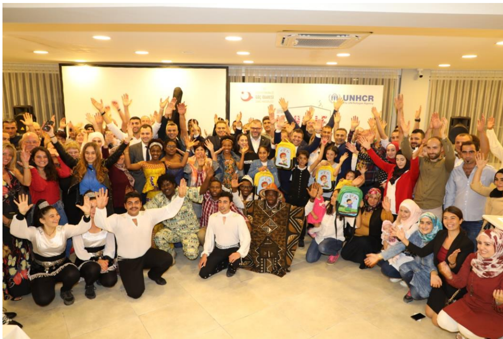
Participants gather for a group photo after the neighbourhood gathering held in Fethiye, Muğla on 18 October, which brought together refugees and the host community to foster a culture of living together.

As of end of October, close to 15,020 submissions for resettlement of refugee cases (64 per cent Syrian and 36 per cent refugees of other nationalities) were made to 18 countries. Over 9,701 refugees departed for resettlement (78.5 per cent of them Syrian).