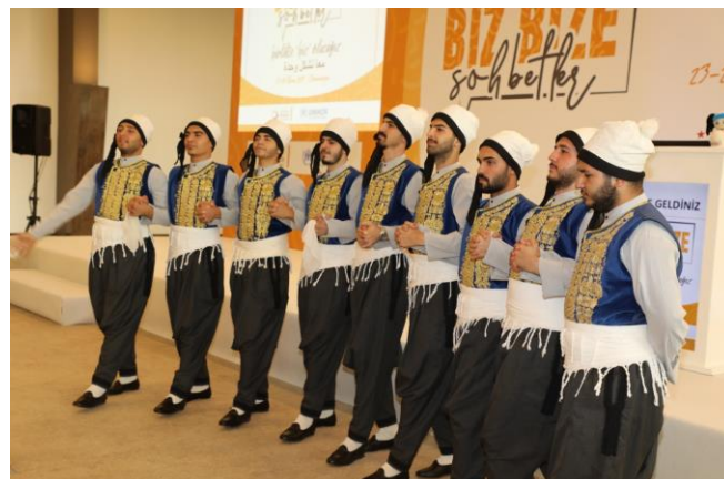
Performance by the Folk Dance Team of Osmaniye Public Education Center during the engaged conversations event in Osmaniye on 23-24 October.

Additionally, two Engaged Conversations were held in Konya and Osmaniye in October. The two events collectively reached around 620 refugees and host community members. They included four focus group discussions with refugees and four with host community members focusing on social cohesion. The engaged conversations were also covered on various government websites and the media. DGMM representatives, including the Head of Harmonization and Communications Department and the Head of the Department of the Protection of Human Trafficking Victims, emphasized the contributions refugees and migrants make in their host countries, stressing that generalizations should be avoided and respect maintained regardless of ethnical, religious and cultural differences.