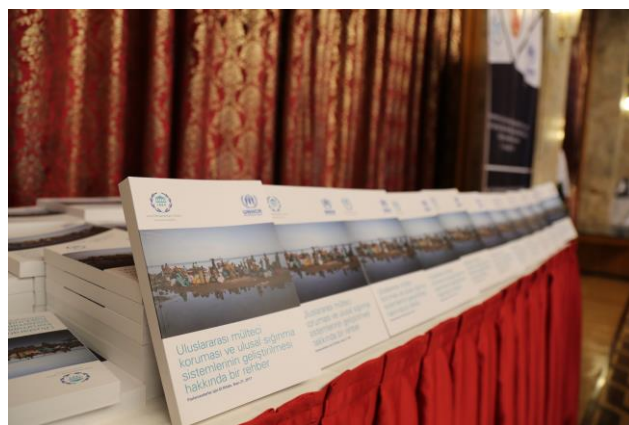
Launch of the Turkish version of the Handbook for Parliamentarians in collaboration with the Inter-Parliamentary Union Group at the Turkish Grand National Assembly in Ankara.