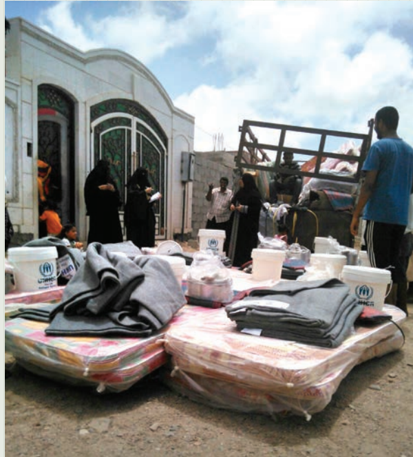
Distribution of relief items, including mattresses and blankets, to displaced people in Yemen

The UN refugee agency said on Friday (3 July) that it had managed to continue to deliver humanitarian aid to displaced people in Yemen in May and June despite severe restrictions on access.