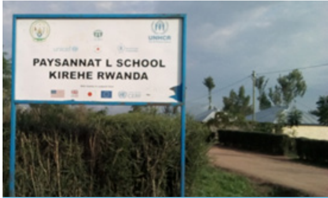
Paysannat L attended by both Rwandans and refugees from Mahama camp

Education has become a catalyst for harmony between more than 23,000 Burundian and Rwandan students since 2016.