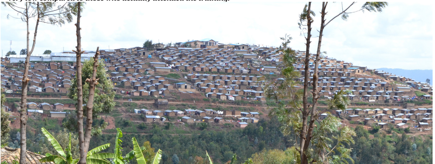
Kigeme Camp accommodates Congolese refugees. It is located in Nyamagabe District, Gasaka Sector

S ome of the residents in Kigeme camp and outside this camp are among people who regularly get chances on various occasions for trainings. They include grown-ups and also young men and women. However, one may wonder how those who attended the training put into practice the lessons they learnt. Another question concerns challenges they face and do not manage to utilize those lessons in the society in general. Most of the cases, this is a situation noticed in other camps apart from Kigeme, whereby the number of trainees who put into practice what they got from the training is very low compared to those who actually attended the training.