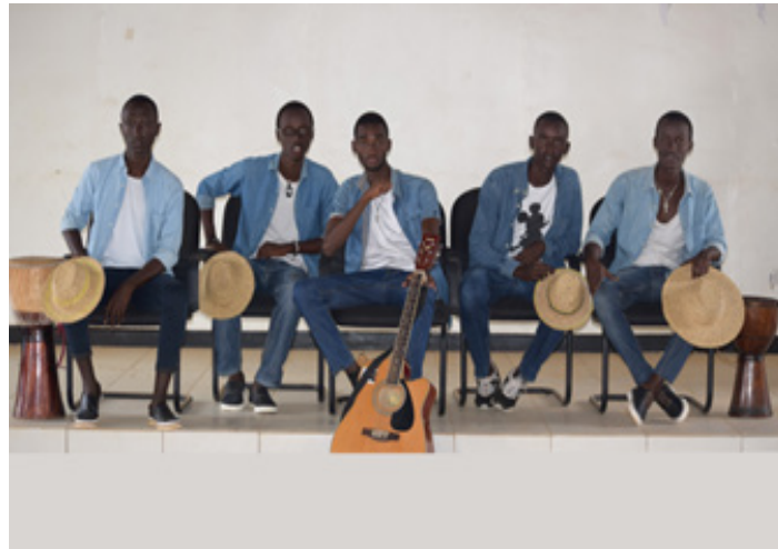
These youths in Mahama Camp perform Burundians' cultural and traditional show considered as a sign of mutual friendship and peace

These youths organize various parties bringing together students and parents. These parties are chance to enhance mutual trust between Rwandans and Burundians. There are also other groups bringing together Rwandans and Burundians, which perform activities of religious worship and allow students to increase their friendship and enhance their mutual trust.