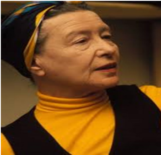
Simone de Beauvoir, a philosopher and women's rights defender

Beauvoir is famous for her book “La maternité n’était pas mon don:” Approximate meaning in English is as follows: “Childbirth was not my talent”. She remarked that her books were scientific heritage for future readers, for all the readers who would call her a mother. Until now, people remember her for her legacy to the world in promoting women’s rights.