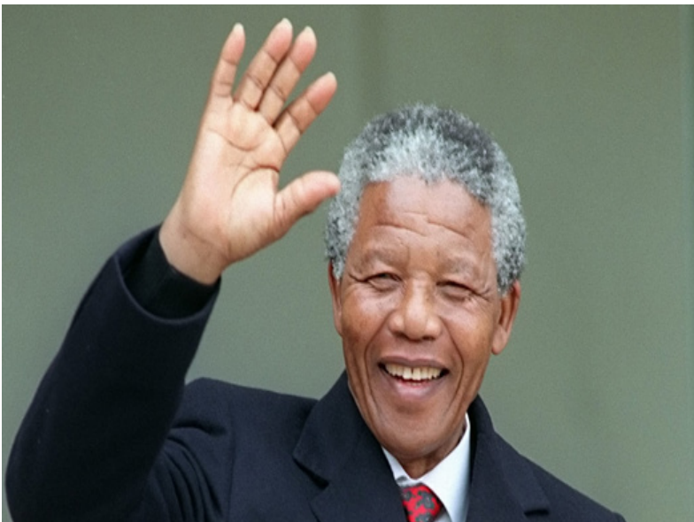
Nelson Madiba Mandela, A South African Statesman, who also became President of this country, after fighting for the rights of black people in this country

Books also contain knowledge on how to resolve conflicts without causing more disputes. It is a source of integrity, good morals, unity and harmony among people on earth. Nelson MANDELA is a perfect example and is a South African Hero. He was a peace pioneer, proved exemplary in enshrining peace among people across the globe even when he was fighting against apartheid in South Africa.