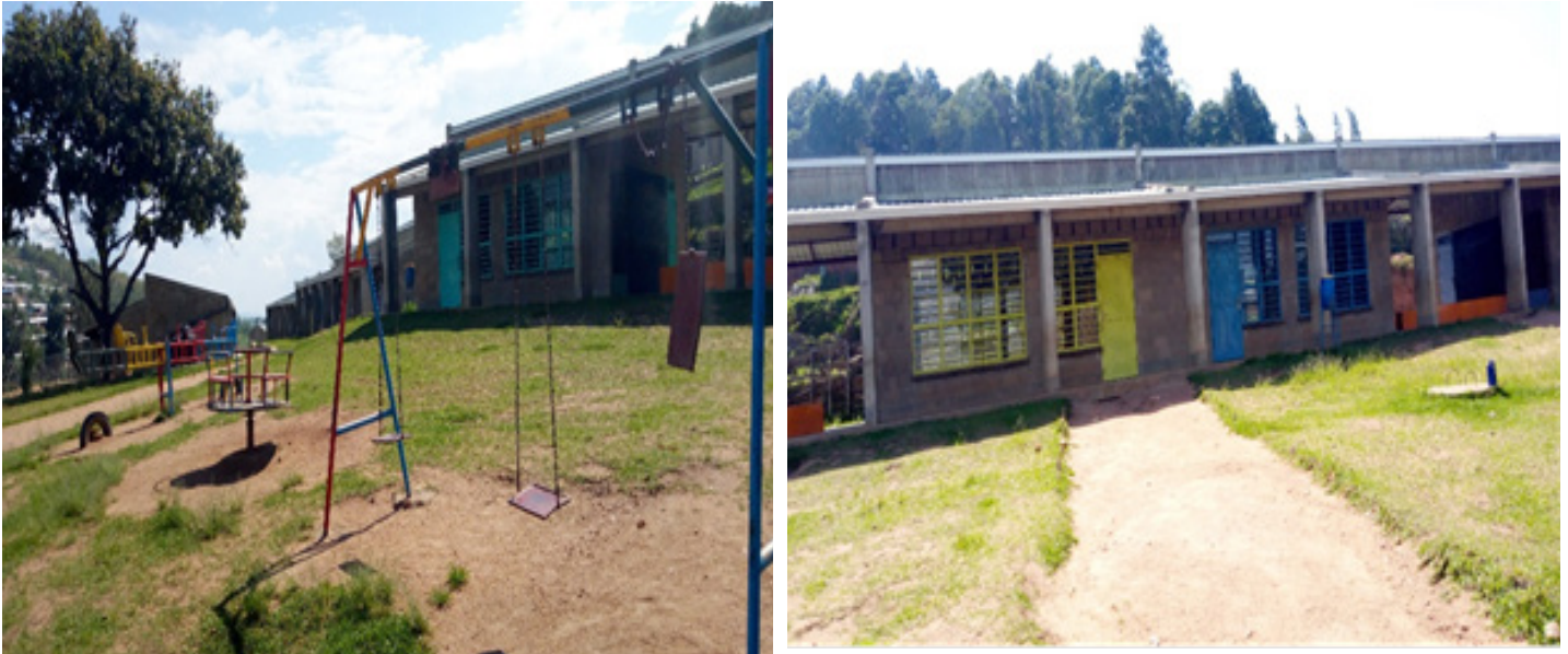
Upon arrival at the ECD centre, you find seesaw and swings used by children when playing and well-built classrooms (Gentille F.)

Classes begin at 7:30 in the morning and close at 11:30 before noon for morning section. Classes for afternoon section begin at 13:30 and close at 6:30. Classrooms are large enough and comprise of twelve (12) classrooms. There are also various activities, water taps, toilets, handwashing device used by children coming from toilet rooms. There are also tools used while playing football, toys and other items to help children enjoy their stay at the centre.