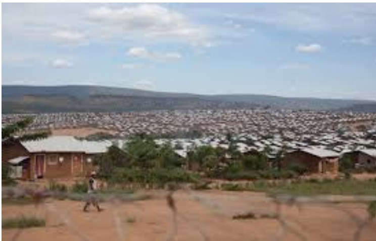
Mahama Camp (Internet photo)

In and around the camp, there are groups of boys and girls who dropped out of school because of the bad habit of going to collect charcoal and other items for sale. They usually circulate in different streets. When you ask what to do for them to return to school, they reply they want money to buy what they need. As regards food, they eat with their parents.