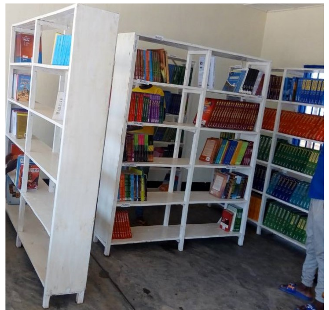
Young and older children meet in the library of Mugombwa camp (File photo)