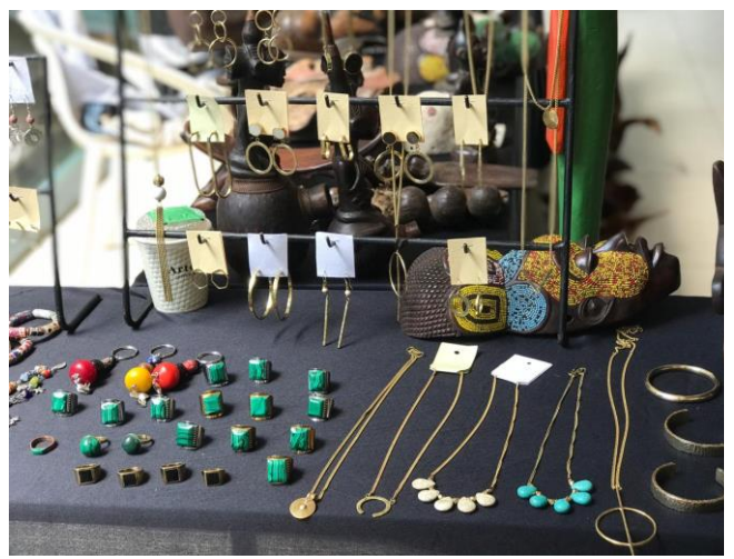
Refugees recently participated in an exhibition at Village Market in Nairobi where they displayed and sold their art and crafts