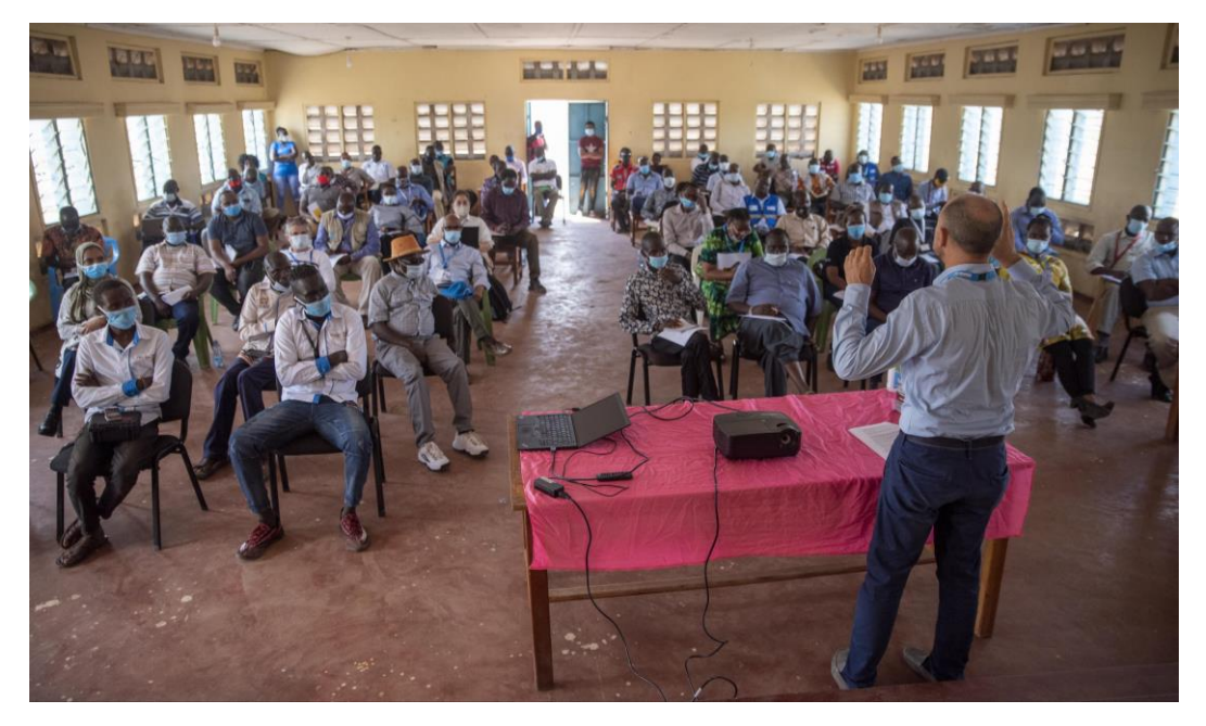
UNHCR Head of Sub Office Kakuma makes a presentation during the KISEDP stake holders forum held in Kakuma town.

Stakeholders meet to take stock of progress made in the implementation of KISEDP : On 2 October, representatives from the national and county governmental agencies, elected representatives, UNHCR and all KISEDP stakeholders came together during a West Turkana stakeholder forum to take stock of milestones implemented under the KISEDP approach. This included highlighting the most significant achievements under the eight thematic areas including health for the host communities in Turkana West. The COVID-19 pandemic was emphasised as to have disrupted the implementation of some of the flagship projects. The meeting took place at the Kakuma Youth Centre in Kakuma town under observance of Ministry of Health guidelines on prevention of the spread of COVID-19.