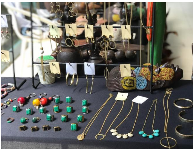
Refugees recently participated in an exhibition at Village Market in Nairobi where they displayed and sold their art and crafts