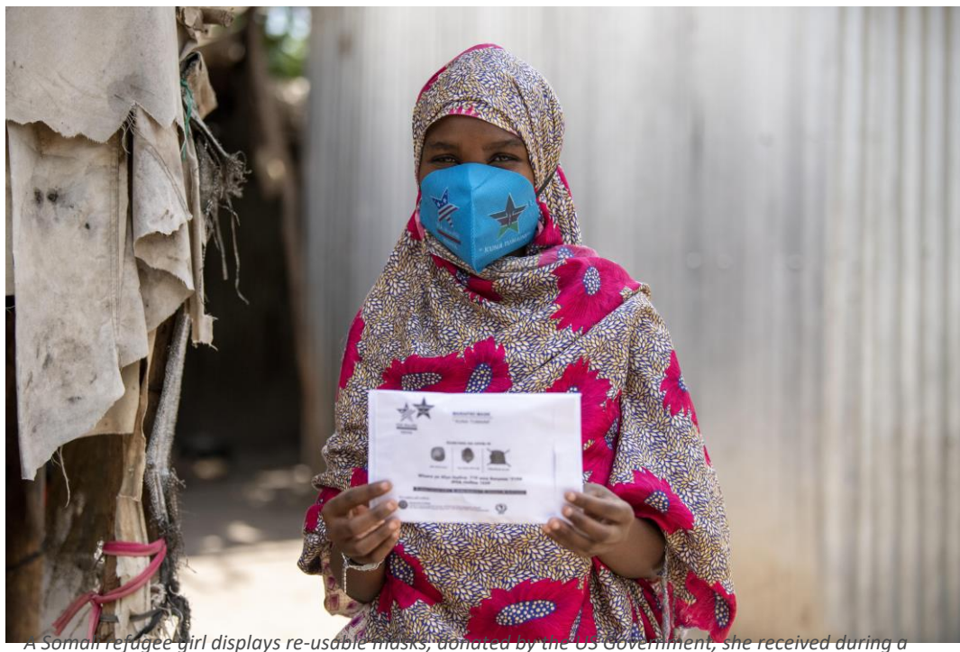
distribution exercise in Kakuma 3.