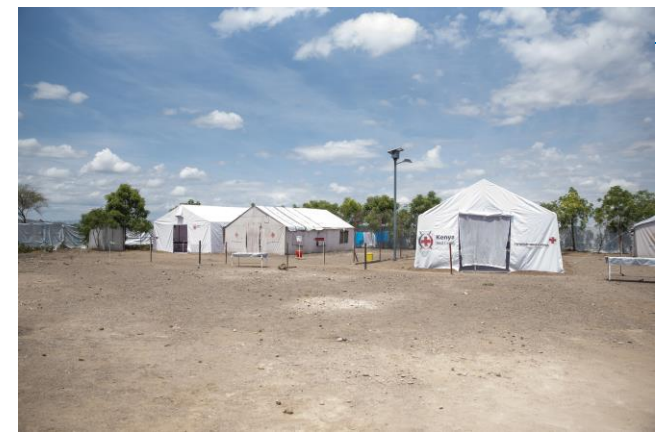
UNHCR supported 36 bed capacity COVID-19 Isolation and Treatment centre at the Nalemsokon Health Clinic in Kalobeyei Settlement.