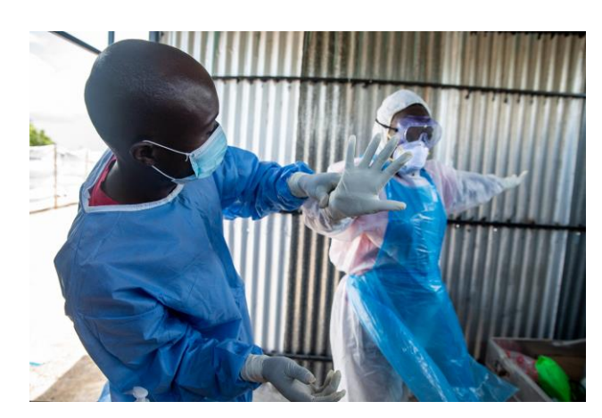
Medical staff put on (don) PPE at the COVID-19 Isolation and Treatment facility at the Nalemsokon Health facility.

Cumulative COVID-19 recoveries recorded as of 31 August 2020