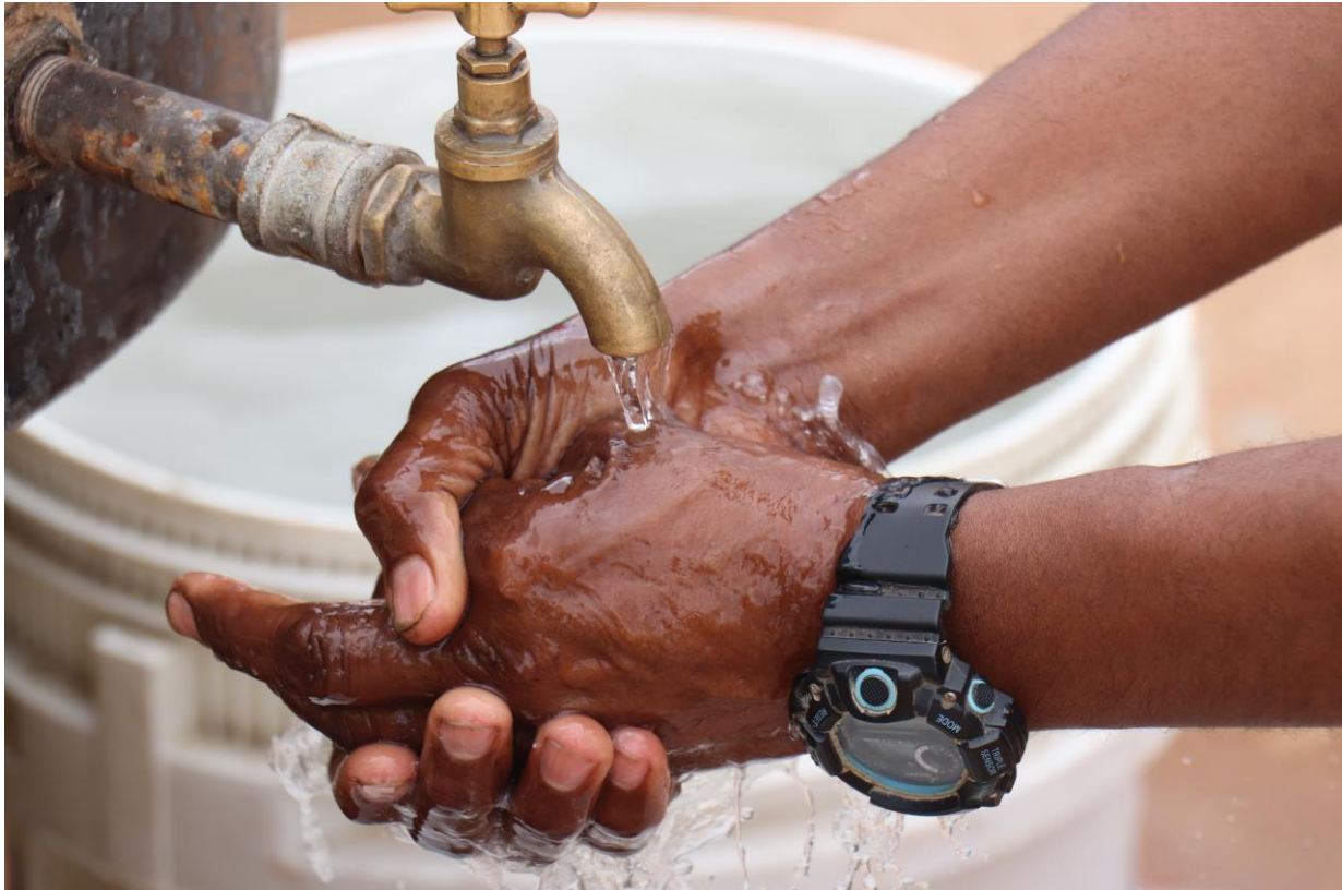
A refugee washes his hands at a food distribution centre, just before collecting his food rations ©UNHCR/ Mohamed Jimale-31 July 2020.