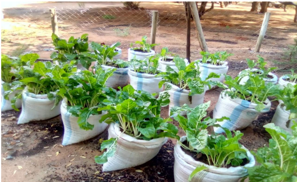
Spinach crop at Alinjgur Tree Nursery (FaIDA, August 2020)