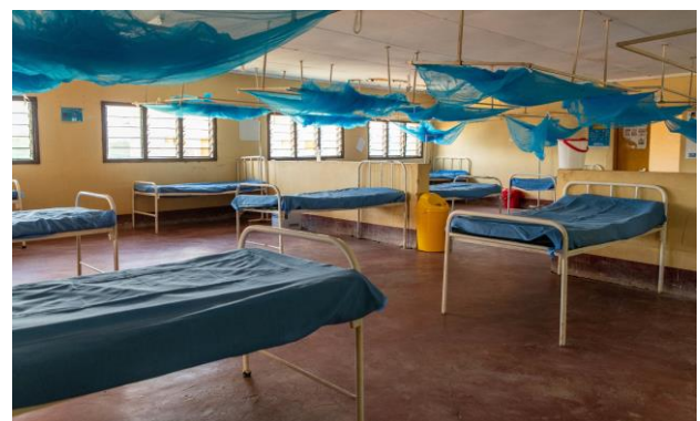
Photo of the Isolation and treatment facility at Ammusait General Hospital where one COVID-19 patient is currently in isolation.

COVID-19 Isolation and Treatment centres established in Kakuma camp and Kalobeyei settlement out of which one is active