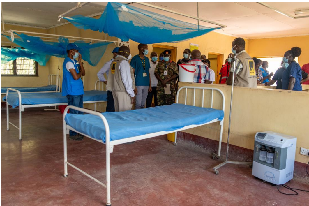
Members of the National COVID-19 Multi-Agency Centre Management, accompanied by the County Commissioner for Turkana, visit the Isolation and Treatment Facility at Ammusait General Hospital.