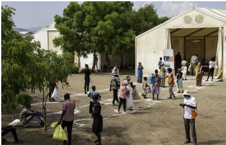
Persons of concern queue to collect food and Core Relief Items during a general distribution exercise at the Food Distribution Centre 4, in Kakuma 4.