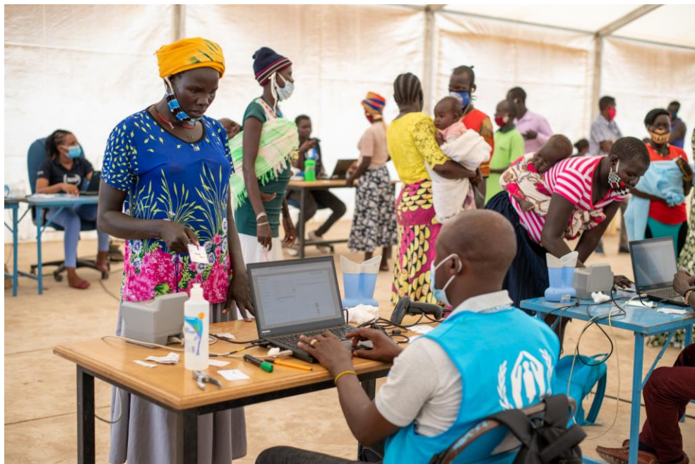
A refugee woman takes part in a Proof of Life activity in Kalobeyei settlement after which she will receive a token that will enable her collect firewood for her energy needs.