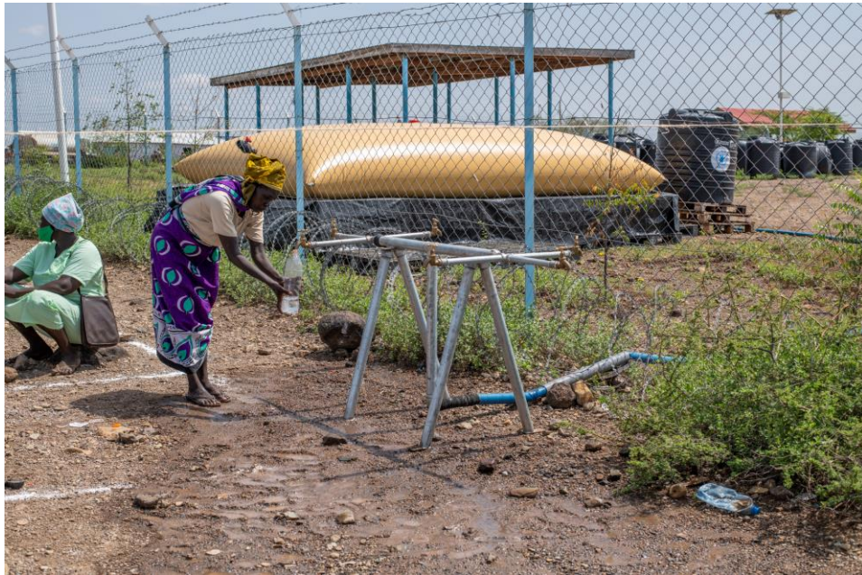
A woman fills her water bottle from a water tap, connected to a bladder tank, installed to provide clean drinking water during the Proof of Life activity in Kalobeyei settlement.