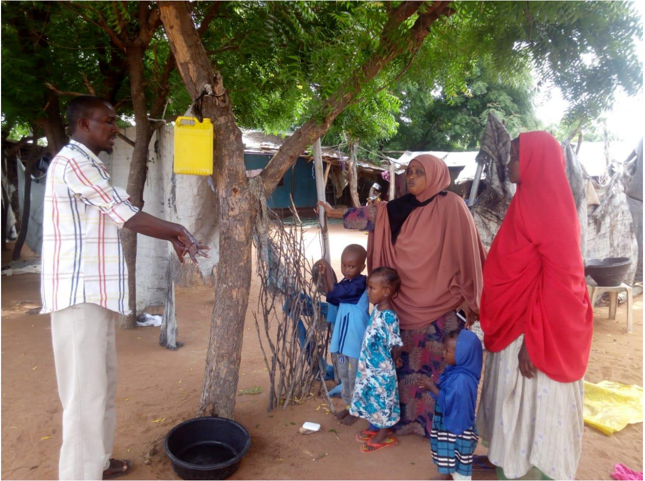
Community worker disseminating information on proper handwashing techniques in Hagadera Camp.