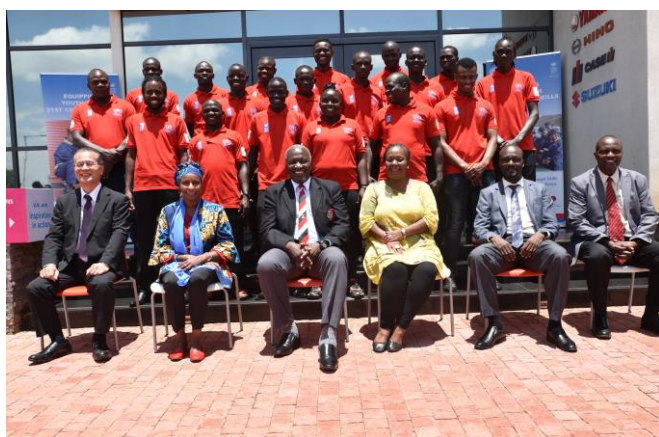
10 refugees and 9 Kenyans mainly from #Turkana County have been enrolled to the prestigious Toyota Kenya Foundation Academy for advanced auto mechanics course. The programme that was officially launched on Friday 28 February 2020 is being implemented in partnership with Toyota Kenya Ltd, UNDP Kenya, UNHCR Kenya.