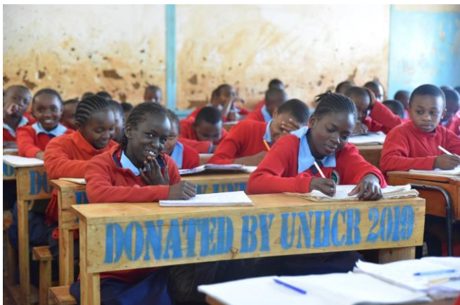
Kenyan and refugee pupils at Kabiria primary school in Nairobi. This is one of the public schools that received 36 desk donations from UNHCR courtesy of generous contribution from the Big Heart Foundation.