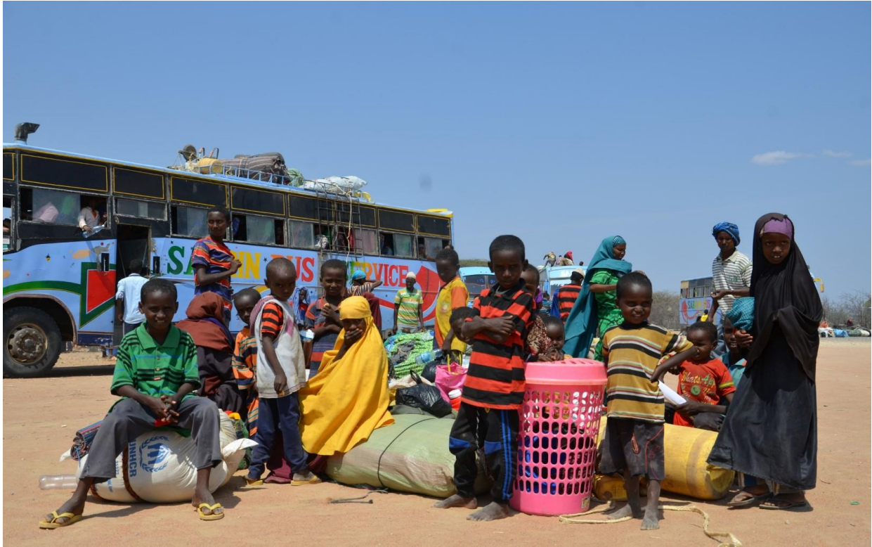
Refugees returning to Somalia under UNHCR's voluntary repatriation Program.