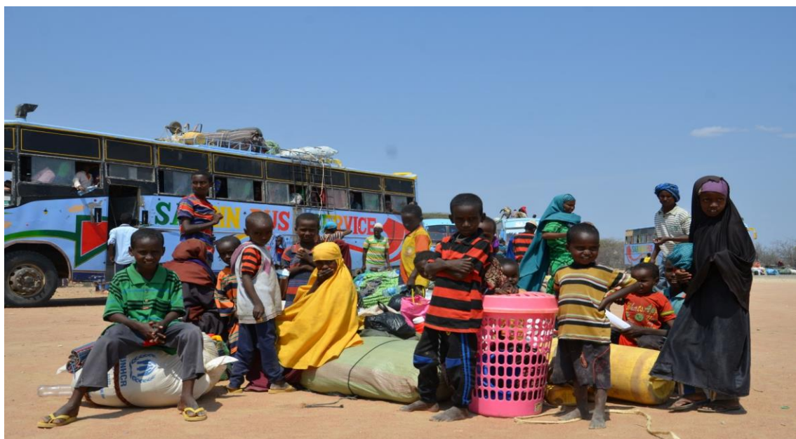
Refugees returning to Somalia under UNHCR's voluntary repatriation Program.

On 16 Oct the Ambassador of Ethiopia came to Dadaab and had meeting with representatives of the Ethiopian refugees and responded to their queries. Soon another delegation from the Ethiopian Embassy is expected to come to process issuing of travel documents. In the meantime, logistical arrangements as well as bidding for the flights are underway.