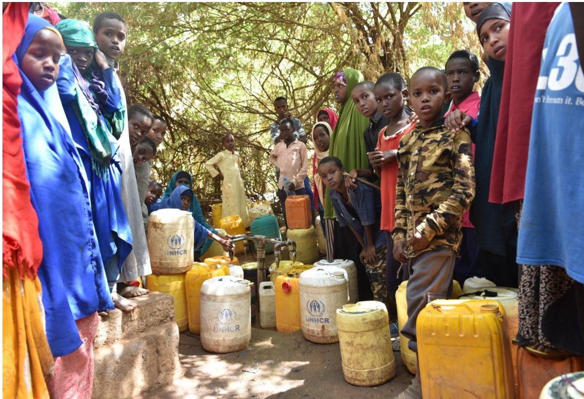
Refugees collect water from one the water distribution points in Ifo camp of Dadaab.