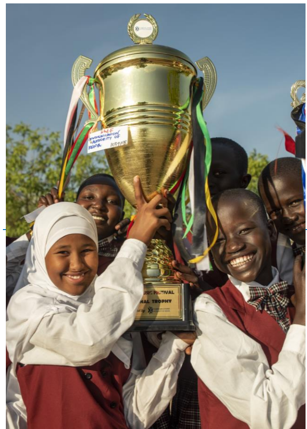
Angelina Jolie schoolgirls pose for a photo with one of the 10 trophies won at the Kenya National Music Festival.

Refugee and Kenyan girls top 2019 National Music Festival