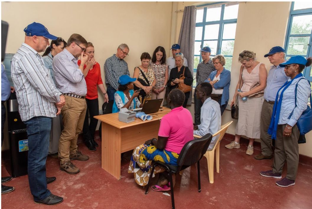
EU delegation pay keen attention to a demonstration of KASI, one of UNHCR's Innovative Protection Tools, at the Kalobeyei Field Post.