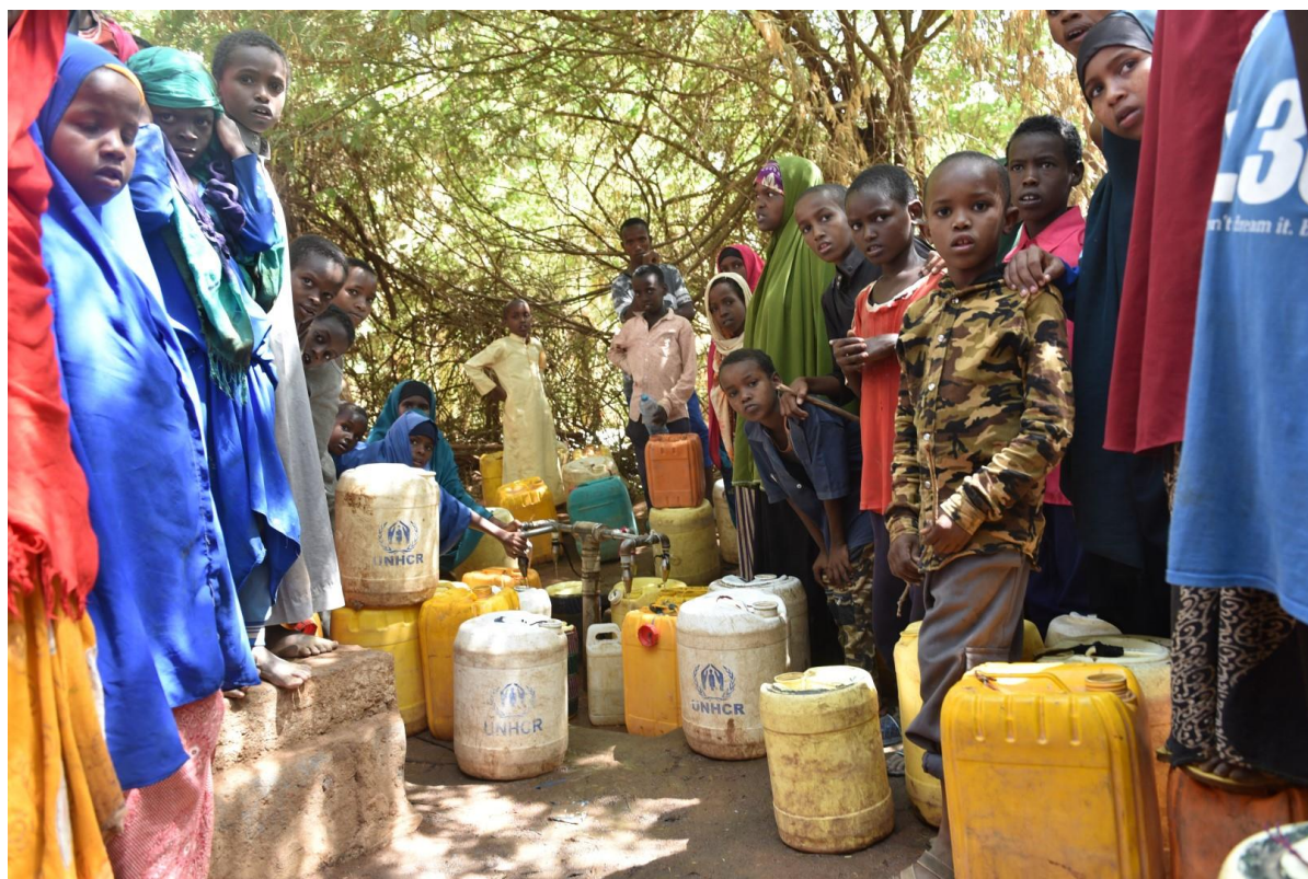
Refugees collect water from one the water distribution points in Ifo camp of Dadaab.