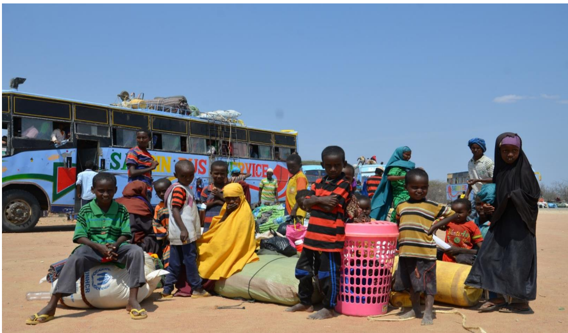
Refugees returning to Somalia under UNHCR's voluntary repatriation Program.