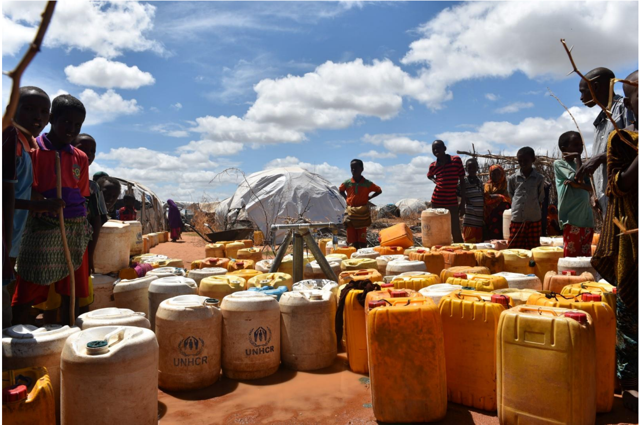
Refugees collect water from one the water distribution points in Ifo camp of Dadaab.

tanks with a total storage capacity of 4,550 m 3 , distributed through a pipeline network of 235 km and relayed to 668 tap stands with about 2,784 taps, scattered around the three camps.