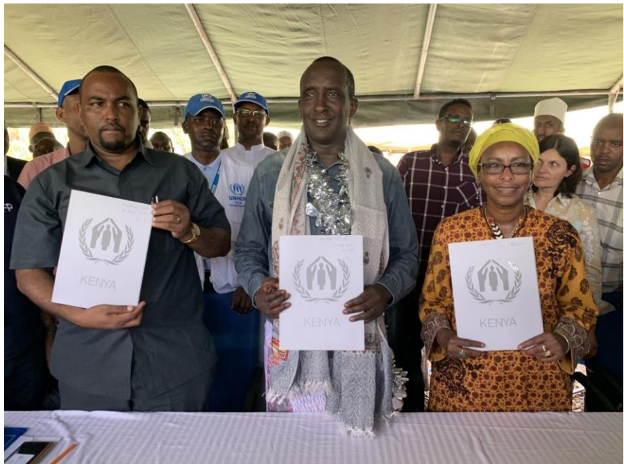
Kambioos and Ifo2 refugee camps were officially handed over to the Government on 21 st June 2019.

The handover documents were signed and handed over by UNHCR to the Ministry of Interior and Coordination of national Government and subsequently handed over to the Garissa County Government.