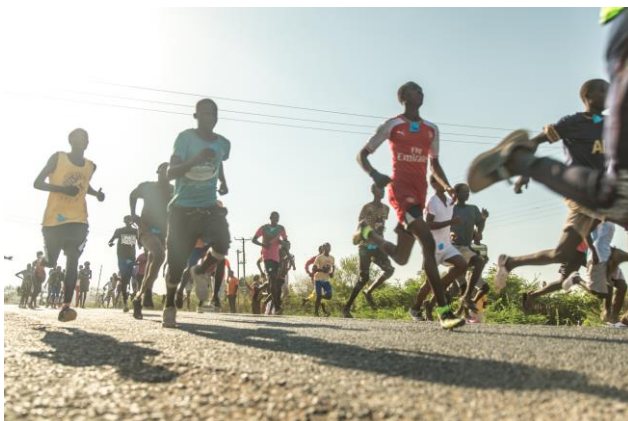
Refugee athletes compete in one of the 'We Run' athletics trial event in Kakuma refugee camp and Kalobeyei settlement.