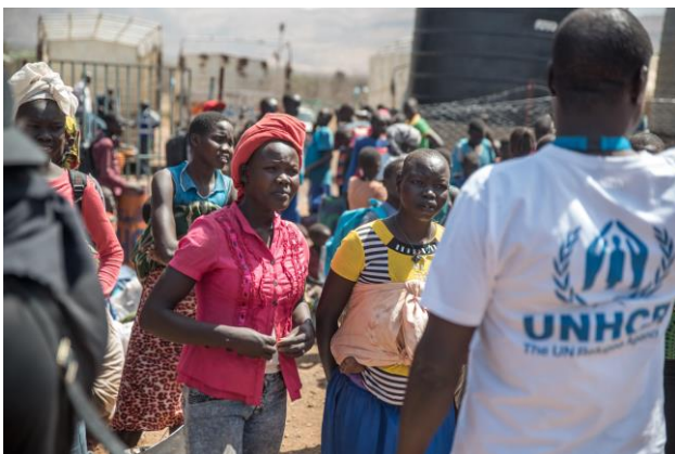
Newly arrived refugees are briefed by a UNHCR staff at Nadapal Transit centre before being facilitated to Kakuma Camp. Over 75% of registered newly arrived refugees are from South Sudan.