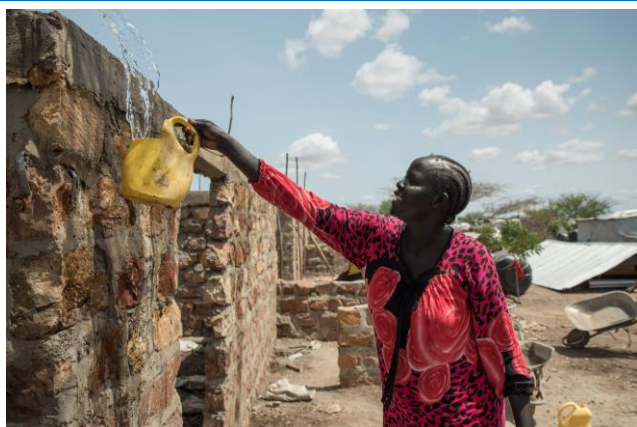
A refugee woman in Kalobeyei settlement pours water on her house to cure the cement. UNHCR has rolled out the first cycle of CBI for shelter in which 200 refugee families have started the construction of their permanent homes.