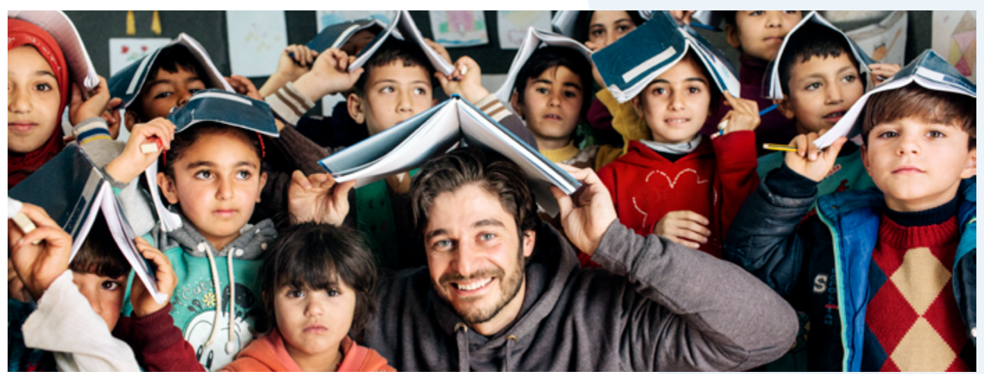
Celebrity supporter Lino Guanciale helps to raise funds for education for refugee children.

UNHCR advocates for improved rights and opportunities for refugees through public events and awareness-raising initiatives and campaigns. Communication activities make strong use of digital content for media and social media and of celebrity supporters to reach the widest possible audience. Our staff work closely with journalists, providing information and training, including through our partnership with <u>Carta di Roma</u>. We support instruction about refugees in schools and universities and provide teachers and students with tools to raise awareness of refugee issues, such as the <u>teachers' toolkit</u> and the <u>Viaggi da Imparare</u> platform.