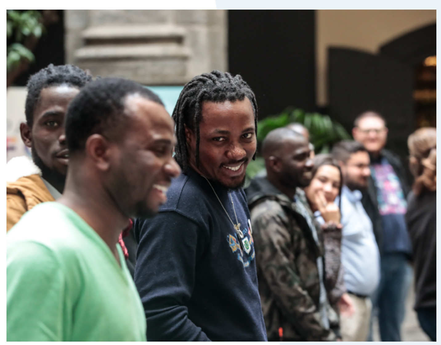
Representatives of refugee-led organisations attend a networking event supported by UNHCR.

In everything we do, we treat refugees as partners, not people for whom we make decisions. At the planning stage of our activities, we sit with representative groups to make sure all voices are heard. In partnership with <u>Intersos</u>, we promote the capacity development of refugee-led and community-based organizations through the <u>PartecipAzione</u> programme, which provides small grants, tailored coaching and training on a range of subjects, including project management, fundraising, and public speaking.