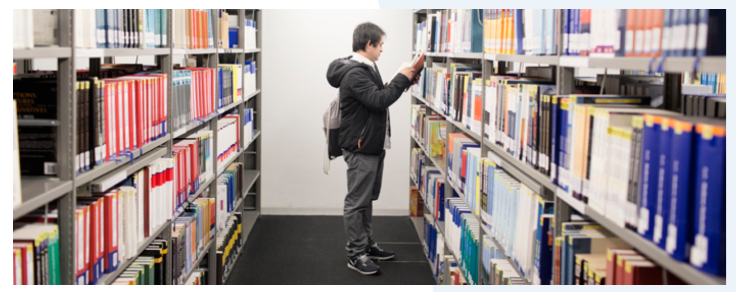
A refugee from Afghanistan studies in the library of the University he attends in Italy.

Recognized refugees enjoy many of the same rights as citizens – freedom of movement, access to jobs, education, health care and other social services. There are numerous barriers however to the realization of these rights. To help refugees thrive in Italy and allow them to fully contribute to the economic, cultural and social life of the country, UNHCR supports implementation of the Government's national integration plan. Our staff also engage with the private sector to promote refugees' employment. Through <a href="Welcome">Welcome</a>, UNHCR supports a logo award programme for companies providing employment to refugees. In partnership with <a href="Fondazione Adecco per le Pari Opportunitá">Fondazione Adecco per le Pari Opportunitá</a>, UNHCR provides training on career guidance for refugees to reception staff. UNHCR also supports implementation of a <a href="Manifesto">Manifesto</a> through which Italian universities commit to providing access to higher education to refugees through scholarships and tutoring programmes as well as active participation in academic life and the recognition of foreign educational qualifications.