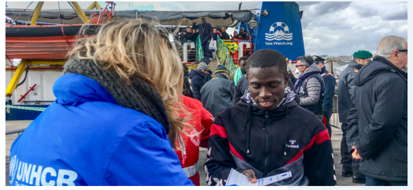
\textbf{UNHCR} \ is \ present \ at \ disembarkation \ to \ provide \ information \ and \ support \ to \ new \ sea \ arrivals. \

Throughout the country, UNHCR, together with its partner organizations, works to ensure that refugees have full and reliable information on their rights and obligations and the services available to meet their needs. For example, in Friuli-Venezia Giulia, our partner <u>CIR - Consiglio Italiano per i Rifugiati</u> provides new arrivals crossing the Italy-Slovenia border with accurate information on their rights. In partnership with <u>ARCI</u>, UNHCR supports a national toll-free number providing refugees with free legal counseling and information, as well as <u>Juma Map</u>, an open source map of services and resources available for refugees across Italy. In Rome, UNHCR runs a drop-in service, providing refugees with information through individual, confidential counseling.