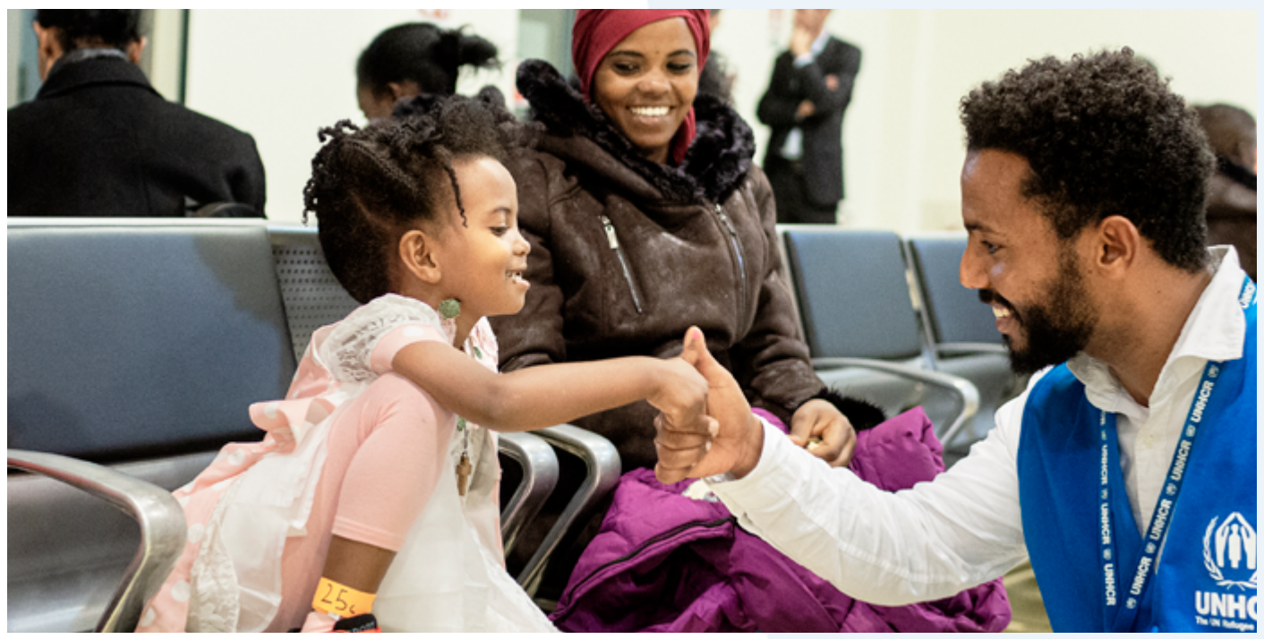
A UNHCR staff member entertains an Eritrean child after she arrived in Italy on an evacuation flight from Niger.

Our teams are particularly attentive to children travelling on their own and to keeping them safe from exploitation, violence and abuse. We do so by developing child-friendly materials to be delivered at arrival points and in dedicated facilities, explaining children's rights and the navigation of relevant procedures, such as refugee status determination. We also regularly train authorities and frontline personnel working with children to enable them to identify and respond to children and their needs. In partnership with CIR – Consiglio Italiano per i Rifugiati, we support efforts to train and assist guardians, that is, the adult volunteers appointed by authorities to ensure that children on their own receive the care, accommodation, education, healthcare and other services they require. UNHCR also works through partner CIDAS to ensure that children on their own can be reunited with their family members in other European countries, including by following up on selected individual cases and identifying good practices across Italy.