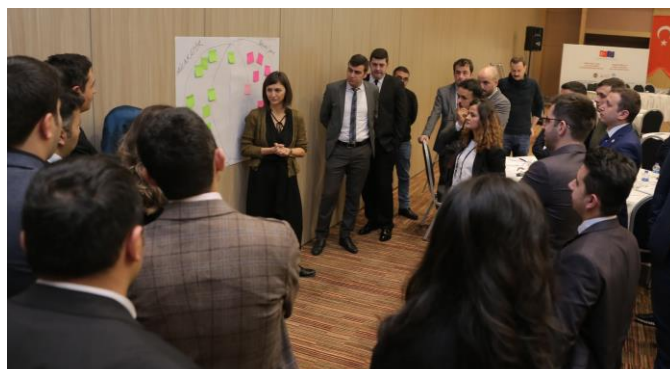
DGMM/UNHCR training on standards and procedures of International Protection Status Determination which took place in Ankara 13-17 January.

UNHCR delivered two specialised trainings in January organised jointly with DGMM. One focused on exclusion analysis (16-17 January) and provided guidance on conducting international protection status determination interviews for cases containing elements which trigger the application of exclusion clauses within the scope of Article 1F of the 1951 Convention, establishing material facts for exclusion and conducting exclusion analysis. The training benefited DGMM and UNHCR staff engaged in international protection status determination interviews and decisions recommendations at the Ankara Decision Centre for complex claims. The second training was on interviewing techniques in the context of human trafficking. It was held on 23-24 January and benefited PDMM and DGMM staff members.