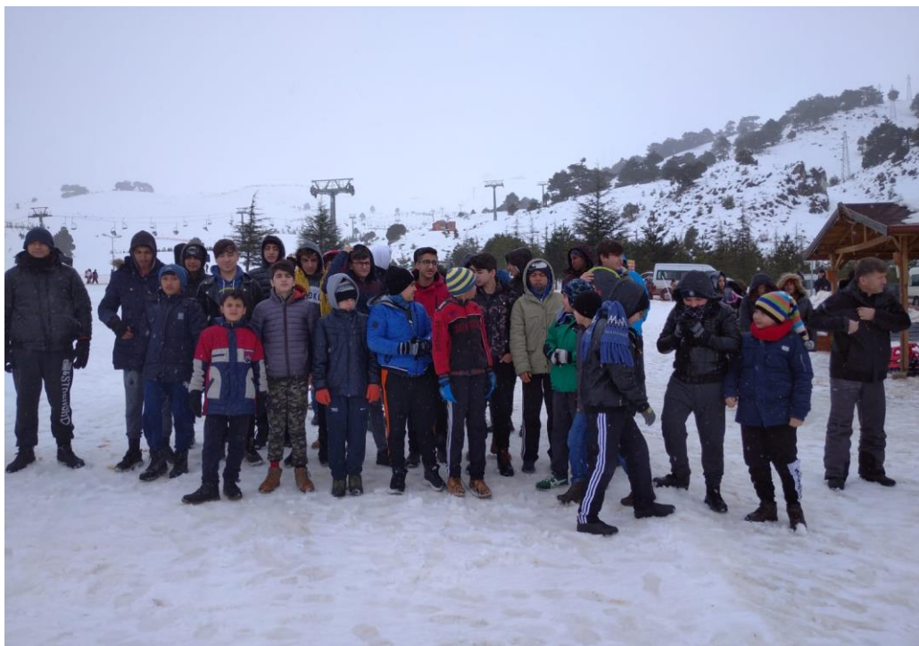
Excursion in Isparta bringing together refugees and members of the host community in the spirit of mutual communication and social cohesion.

In January, UNHCR Turkey’s Facebook page reached a total of 35,876 followers and the Twitter account gained 570 new followers amounting to around 20 new followers per day. UNHCR has launched its active engagement in the global Model United Nations Refugee Challenge in 2020, with a series of events at universities across Turkey to encourage young people to debate issues related to forced displacement. The challenge focuses on the themes of climate change and displacement; countering toxic narratives about refugees and migrants; supporting the economic inclusion of refugees; and improving access to education for refugees. The award-winning resolutions will be shared with policymakers.