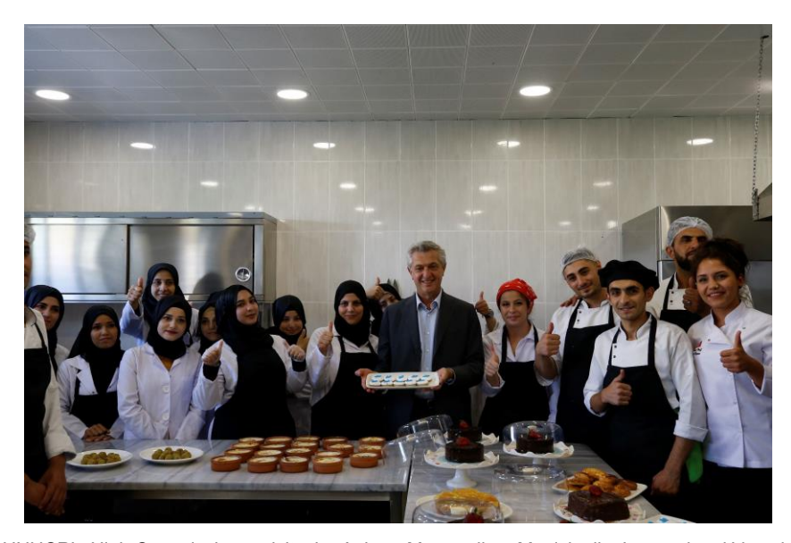
UNHCR's High Commissioner visits the Ankara Metropolitan Municipality International Vocational Training Centre during his visit to Turkey in September 2019.