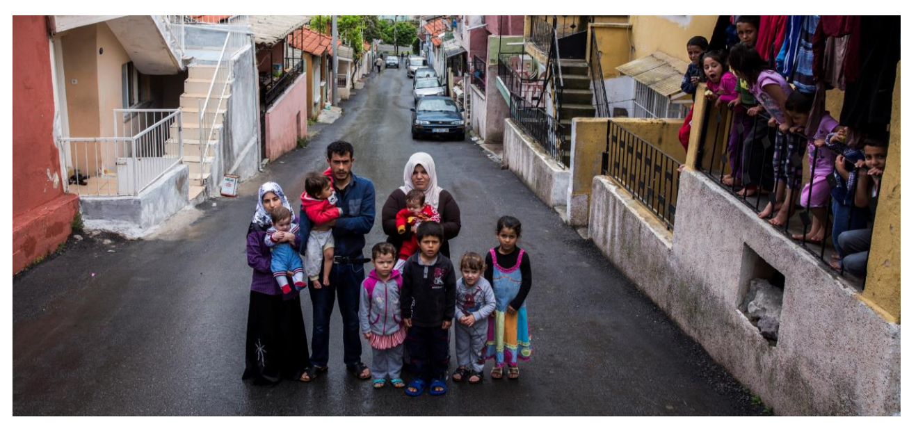
Refugee Family in Izmir