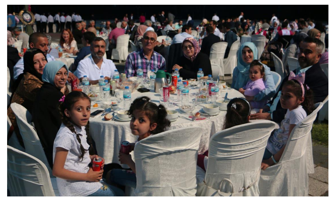
Neighbourhood gatherings between refugees and the host community as part of DGMM and UNHCR's Harmonization Initiative took the form of Iftar dinners in May 2019.