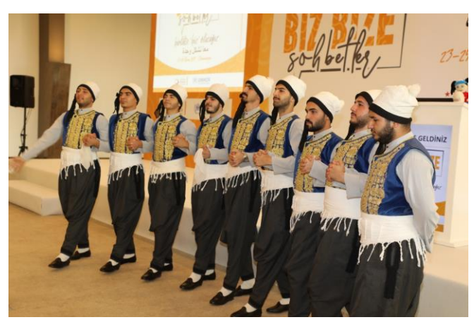
Performance by the Folk Dance Team of Osmaniye Public Education Center during the engaged conversations event in Osmaniye on 23-24 October.

Additionally, two Engaged Conversations were held in Konya and Osmaniye in October. The two events collectively reached around 620 refugees and host community members. They included four focus group discussions with refugees and four with host community members focusing on social cohesion. The engaged conversations were also covered on various government websites and the media. DGMM representatives, including the Head of Harmonization and Communications Department and the Head of the Department of the Protection of Human Trafficking Victims, emphasized the contributions refugees and migrants make in their host countries, stressing that generalizations should be avoided and respect maintained regardless of ethnical, religious and cultural differences.