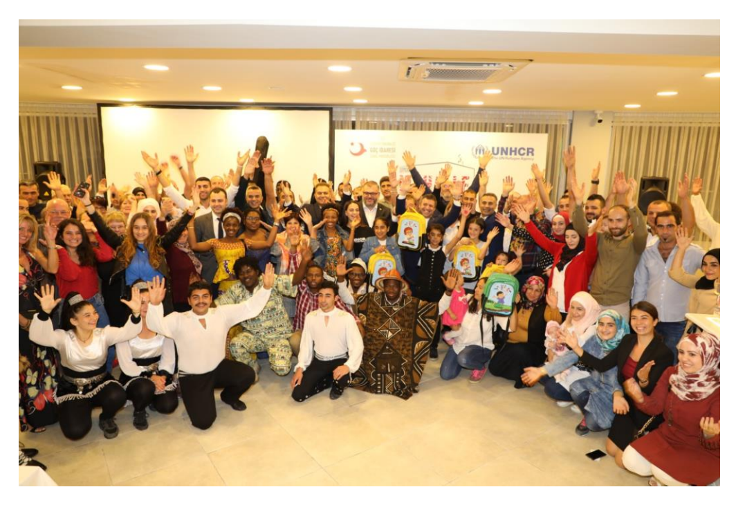
Participants gather for a group photo after the neighbourhood gathering held in Fethiye, Muğla on 18 October, which brought together refugees and the host community to foster a culture of living together.

As of end of October, close to 15,020 submissions for resettlement of refugee cases (64 per cent Syrian and 36 per cent refugees of other nationalities) were made to 18 countries. Over 9,701 refugees departed for resettlement (78.5 per cent of them Syrian).