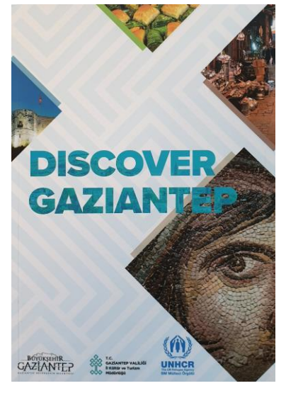
Cover of the English version of the Discover Gaziantep booklet.

In Gaziantep, UNHCR began to distribute 20,000 copies of the 'Discover Gaziantep' booklet, published in four languages (English, Turkish, Arabic, Farsi). Discover Gaziantep is a community support project that was initiated in 2017 in cooperation with Gaziantep Metropolitan Municipality. The official launch is expected to take place in October as part of a workshop on social cohesion. On another note, ASAM is rolling out theatre performances of the Youth Committee across South East Turkey as part of its community support activities to promote social cohesion. The latest performance was held in Maras on 4 August with an audience of 400 people including Maras' Deputy Governor.