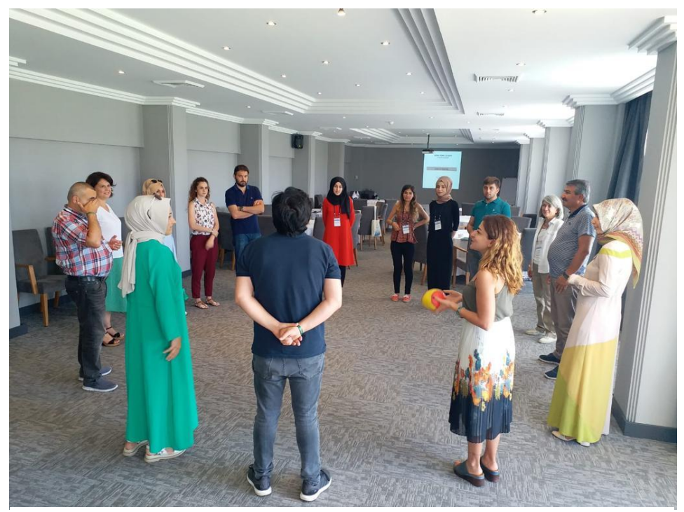
Training Social Service Centre staff during the regional social service workshop in Izmir. @{\sf UNHCR}

UNHCR monitors the voluntary nature of self-organised returns and ensures that all who wish to return are provided with necessary information as to the consequences of their decision. In cases where return is sought as a result of protection-related issues, UNHCR provides counselling on possible interventions in Turkey to enable individuals to make informed decisions. As of 31 August, the total number of voluntary return interviews observed by UNHCR stands at 21,151 individuals (11,068 families) in 2019.