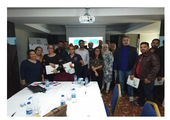
Refugee volunteers discuss their communities' challenges encountered by in Manisa.

Social cohesion: In cooperation with the Union of Aegean Municipalities and Turkish Association of Social Workers (TASW), UNHCR organized the first Social Service and Cohesion Camp for municipal staff in İzmir's Çeşme district. In total, 49 representatives from different metropolitan and district municipalities and six TASW branch offices (in İzmir, Aydın, Manisa, Muğla, Denizli and Antalya provinces) attended the two-day workshop. The workshop supported the capacity development of municipal staff working in social services on topics such as refugee rights, international and national protection framework. Participants also worked in groups to identify gaps in service provision, map services and referrals provided by the municipalities.