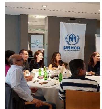
Municipal staff from İzmir's Konak district municipality engage in a discussion during the Needs Assessment and Case Management training in İzmir.

Izmir's Konak and Buca district municipalities signed Letters of Understanding with UNHCR in 2018. As a result, a Refugee Support Desk was established in the Buca district municipality to identify persons with high protection risks and support referrals to relevant institutions, as well as provide counselling and translation services to local community leaders such as mukhtars, municipal staff and school teachers on matters concerning refugees. In the Konak district municipality, a project was established to support impoverished and refugee-dense neighbourhoods by providing family hygiene kits, mold cleaning sets and medical equipment such as wheelchairs.