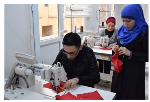
Syrian refugees learn shirt sewing in preparation for their job placement in the textile industry.

Monitoring the voluntary nature of self-organized returns: In cooperation with the İzmir PDMM, UNHCR started to monitor the voluntary nature of spontaneous returns involving Syrian refugees in August 2018 by observing and providing interpretation support to the return interviews conducted by PDMM.