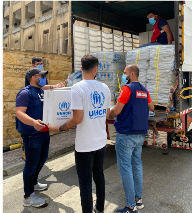
Distribution of shelter kits in areas affected by the Beirut blast is ongoing. We have distributed more than 1,200 shelter kits so far. Our teams are on the ground reaching families in need of urgent support.