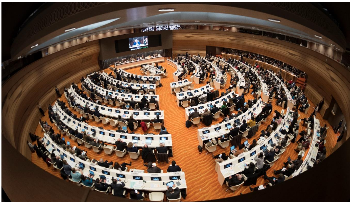
The 2017 High Commissioner's Dialogue on Protection Challenges was used to take stock of progress made in the development of the global compact on refugees, ahead of the release of the 'zero draft' in January 2018.