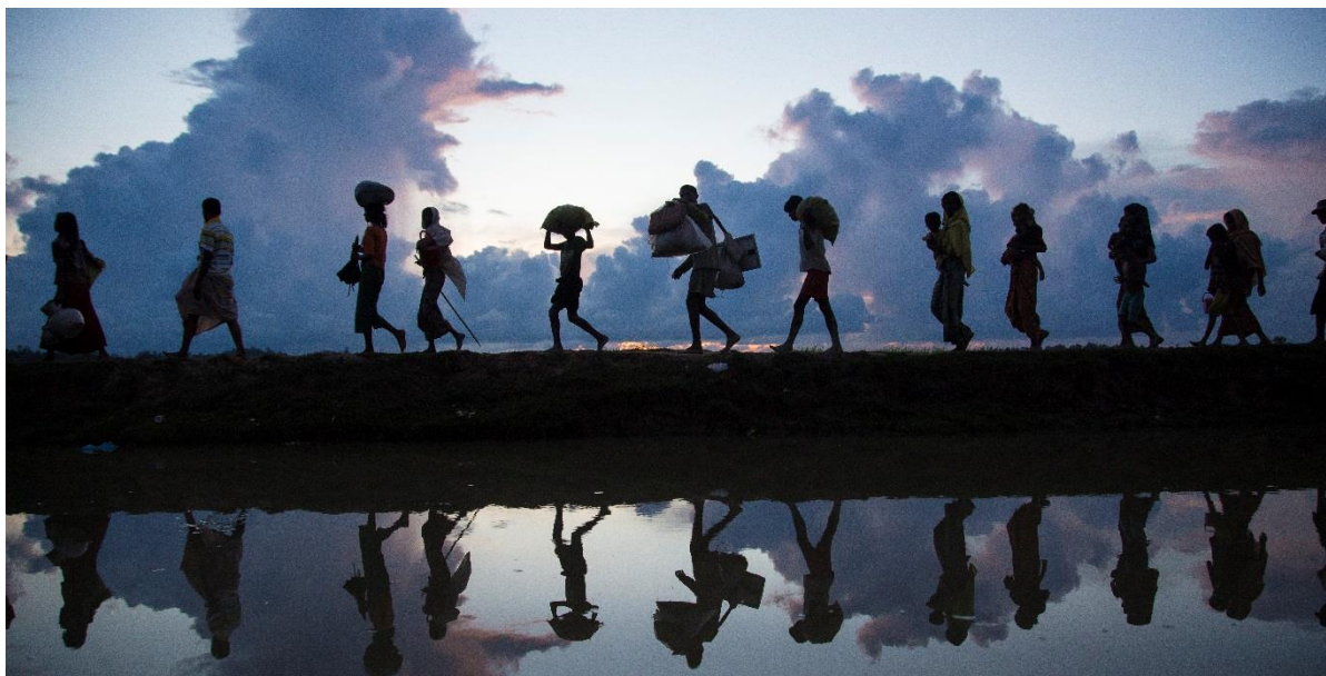
Rohingya refugees enter Bangladesh in October 2017.