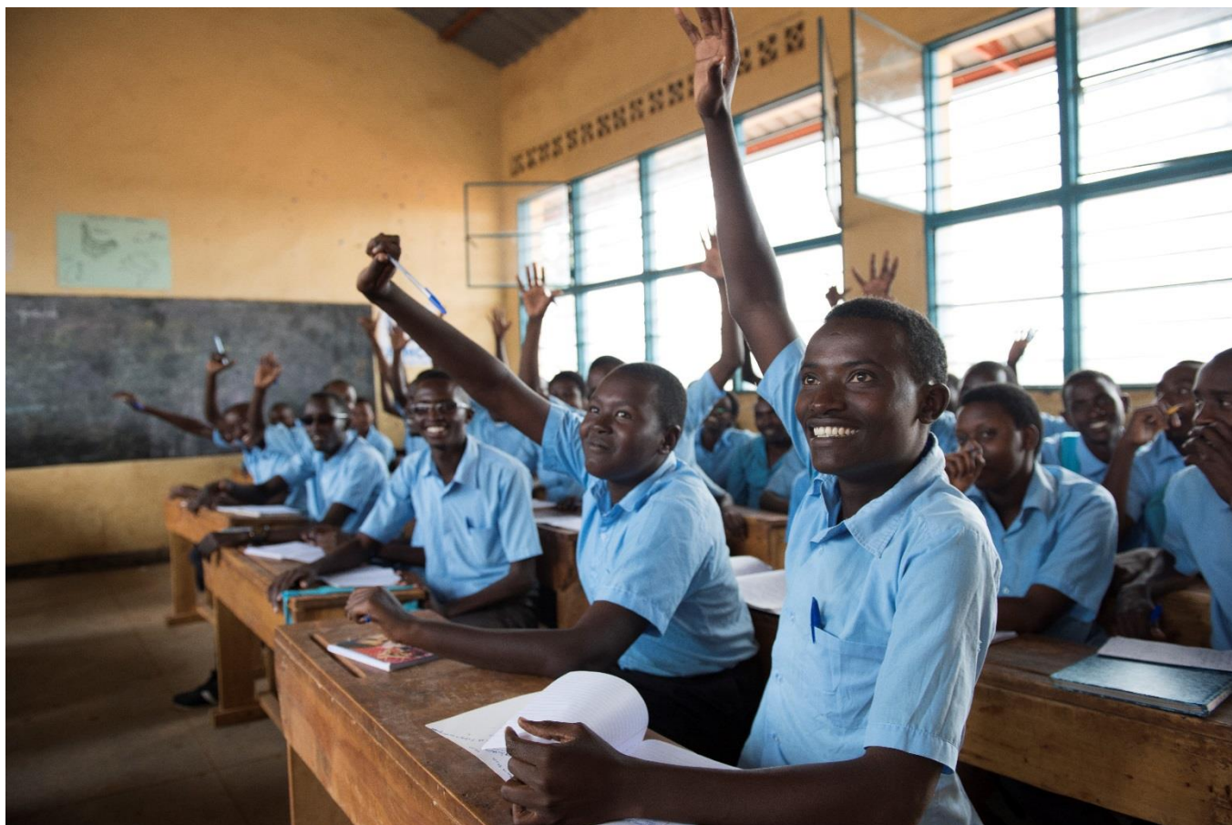
Burundian refugees and members of the local Rwandan host community study alongside one another at the Paysannat School in eastern Rwanda.