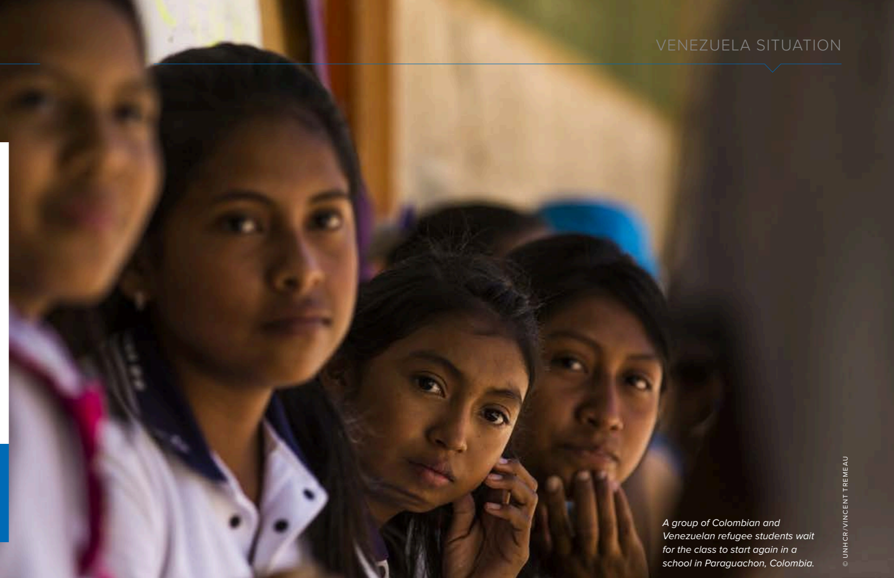
A group of Colombian and Venezuelan refugee students wait for the class to start again in a school in Paraguachon, Colombia.