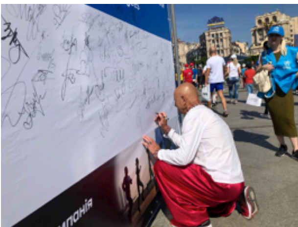
UNHCR was present at Kyiv's traditional "Chestnut Run" event. During the event, UNHCR volunteers explained to runners how they could dedicate the kilometers they would run to the refugee cause as part of the "2 billion kilometers to safety" campaign.

*Residing more permanently in government-controlled areas (GCA). **Vulnerable, conflict-affected persons living along the 'contact line' in GCA and non-government controlled areas (NGCA). ***Sources: 2019 Humanitarian Needs Overview (HNO), UNHCR ****Source: UNHCR PopStats, December 2018 *****28 EU countries and Iceland, Liechtenstein, Norway, Switzerland