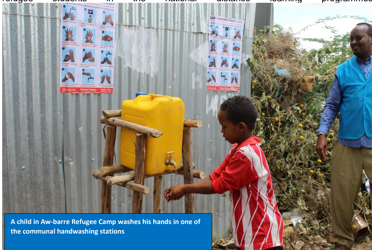
A child in Aw-barre Refugee Camp washes his hands in one of the communal handwashing stations

The Government of Ethiopia declared a five-month state of emergency in early April 2020 as part of the efforts to contain the spread of corona virus in the country. This came weeks after it closed all land borders and schools across the country, leaving millions, including over 200,000 refugee students out of school. UNHCR, ARRA and other partners continue working with the Ministry of Education (MoE) and Regional Education Bureaus (REBs) to include refugee students in the national distance learning programmes.