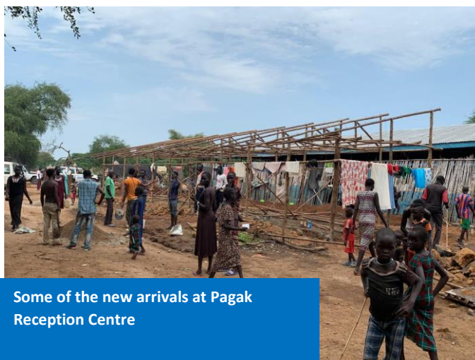
Some of the new arrivals at Pagak Reception Centre

UNHCR and ARRA carried out preliminary (Level1) registration of South Sudanese asylum seekers currently sheltered at the Pagak reception center in Gambella. To date, a total of 8,220 asylum seekers are sheltered in the hangars within the reception centre and in the nearby school compound. Congestion and overstretched services are still a concern, and UNHCR and ARRA are working to decongest the Reception Centre in order to mitigate the spread of COVID-19. Empty shelters are being identified in the existing camps to be able to accommodate some of the most vulnerable people in Pagak.