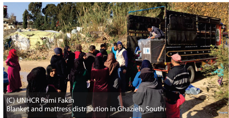
Blanket and mattress distribution in Ghazieh, South

Partners involved in the response: Governor's office, CISP, AVSI, NRC, ICRC, PU-AMI, LRC-DMU, IRC, SHEILD, INTERSOS, TdHL, ACF Spain, UNDP, UNICEF, UNRWA, UNHCR, UNIFIL, WVI, DPNA, Governor's Office, CISP, WFP, Mercy Corps, Caritas, and Save the Children.