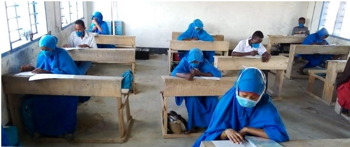
In Dadaab, students are back in class, following the partial reopening of schools. UNHCR and partners are implementing COVID-19 protocols to ensure a safe environment for refugee students and teachers, and are supporting host-community schools.

countries may take place in 2021. Rwanda has set to reopen schools on 2 November for certain classes (upper primary, secondary, Technical and vocational education and training (TVET)). Sudan plans to reopen schools on 22 November. Eritrea and Ethiopia have yet to set dates for school re-opening.