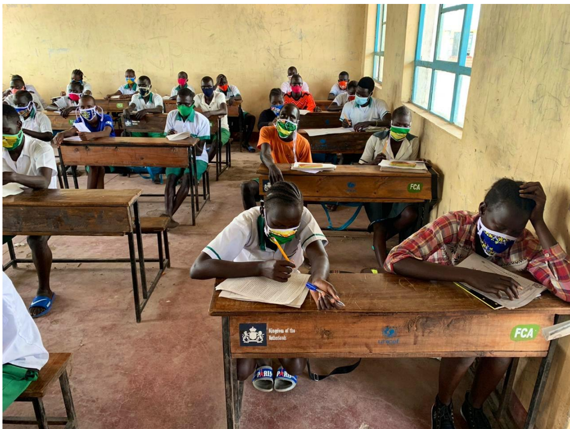
In Kakuma, students are back in class, following the partial reopening of schools. UNHCR and partners are also ensuring that necessary sanitary conditions are in place.

In Kakuma, Kenya , with the reopening of schools during the reporting period, UNHCR distributed over 2,040 kg of soap bars and 2,940 liters of liquid soap to education partners for distribution in 26 primary and six secondary schools. UNHCR's partners also provided trainings on COVID-19 protocols to 54 teachers. On 15 October, UNHCR handed over 30 handwashing stations, 13,112 reusable facemasks, 1,420 kg of soap bars and 1,420 liters of liquid soap to support the safe reopening of 63 primary schools and eight secondary schools for the host community. In addition, 2,316 demonstrations were conducted to increase knowledge of how to locally fabricate tippy taps for regular handwashing.