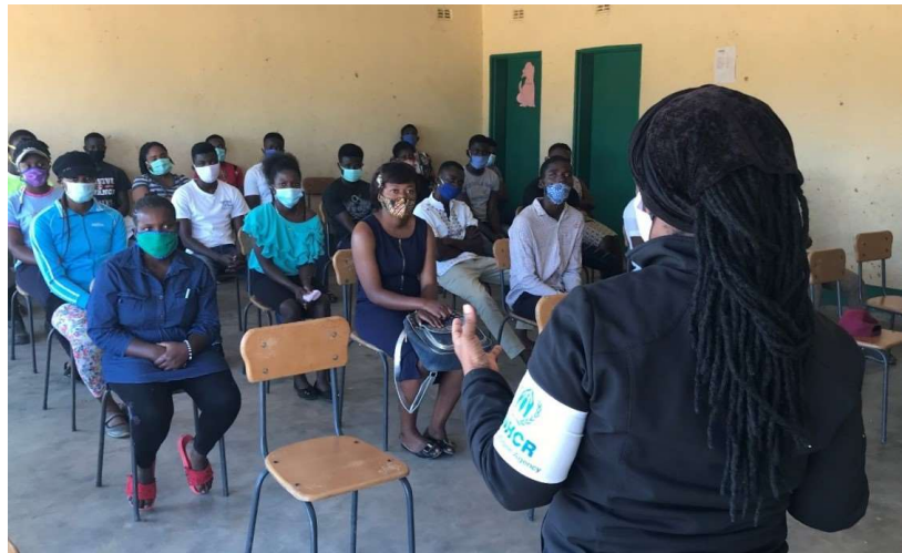
UNHCR protection staff speaking with advanced-level students in Tongogara refugee camp, Zimbabwe.

12,327 families received cash assistance to offset economic impacts of COVID-19 restrictions