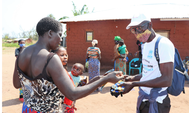
During World Refugee Day activities in Angola, refugees distributed cloth masks they had made to members of the host community.

In country operations, various activities were held to mark WRD while observing COVID-19 regulations. This included a clean-up campaign in Angola, distribution of masks and agricultural tools in the DRC, poetry competitions for refugee children in ROC, interviews on news programmes in South Africa, week-long radio and television programmes in Zambia, and a socially distanced event at a transit centre in Zimbabwe.