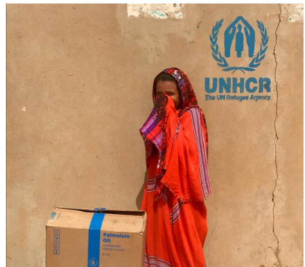
A refugee girl in Mbera camp received food assistance and core relief items during the monthly food distribution